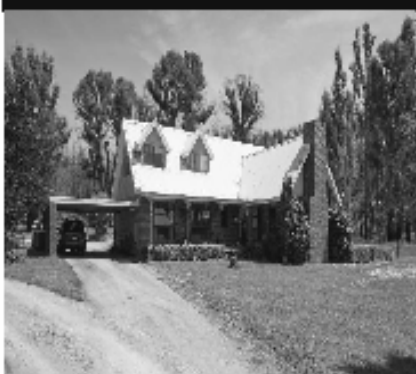
9 STONEY CREEK COURT NARBETHONG "Story Book Setting"

10 Acre (app.) easily managed property with a permanent creek. Quality 4 bed, 2 bath home. Private master B/R with E/S & WIR. Huge family living area with timber lined soaring ceiling, huge inglenook fireplace & secret cellar. Excellent fencing, 4 Bay farm shed, ideal equestrian property.