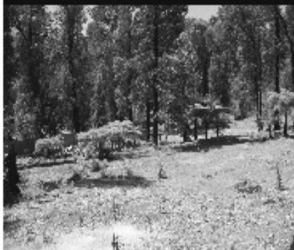
126 FALLS ROAD MARYSVILLE "The Best Of Ideal Corner Site"

A spectacular 2605sqm. (app.) home site for those who are looking for the best. Privacy & seclusion assured with this battle axe property. Tree Ferns in abundance offering a cool and quiet addition. Listen to the bell birds from your own doorstep with Marysville State Forest as a rear boundary.