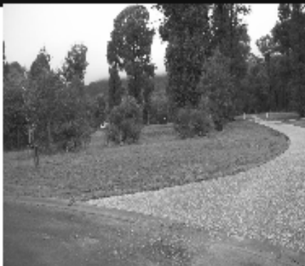
15 GOULD TERRACE MARYSVILLE "Prime Residential Site"

This prime residential site of 1523sqm. (app.) is set directly opposite private parkland. Offering commanding northerly views of the Mountains and Valleys of Marysville. This property is ready for an innovative design to make the most of this site. Set amongst quality new homes and with no rear neighbours.