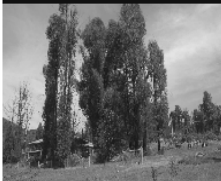
30 ALLISON CRESCENT MARYSVILLE "View The Potential"

Potential plus with this 1169sqm. (app.) nestled amongst quality new homes. Commanding the views that Marysville is famous for and /or create an even more spectacular view with the removal (STCA) of a few key trees. Create the perfect bush retreat, but be just minutes from the main street of Marysville.