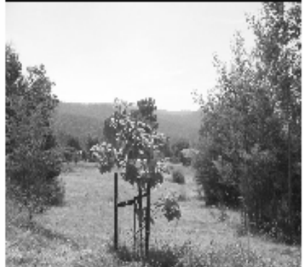
42 SEDGWICK STREET, MARYSVILLE "Uninterrupted Views"

Gently undulating 2064sqm. (app.), views to Mt. Sugarloaf, Mt. Margaret, Lake Mountain. Terraced towards rear to build your dream home with uninterrupted views. Room here to Build B&B, Dual Homes, Accom. Complex (all S.T.C.A). Set amongst quality new homes.