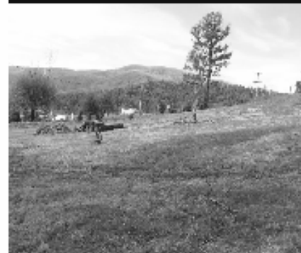
51 SUNDS ROAD MARYSVILLE "Keen Vendors Here"

Large residential property with a wide frontage of 31.4msq. Elevated house site to take in the views of the Marysville. Total property area of 1413sqm. (app.) large enough for you to build that special home. This the property for you if you have been waiting for something different.