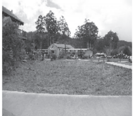
6 MURCHISON STREET "Rare Commercial Property"

Three Road frontages with this new dev. Of 438sqm (app.) in the heart of the Commercial Precinct of Marysville. Plans/permits for - Wine Bar/Grill/Cafe/Produce Store with lic. - 2 Apartments on upper floor. Overlooking Settlers Marysville Central.