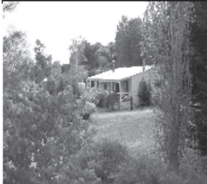
13 BUXTON MARYSVILLE RD. "Peppermint Hill"

Peppermint Hill 5093sqm. (app.) zoned VILLAGE allowing for COMMERCIAL DEVELOPMENT. Home of 4 BR all with BIR, L shape living dining, dado panelling. Ample room for sheds, workshop or Commercial Buildings In Central Buxton—choices are endless.