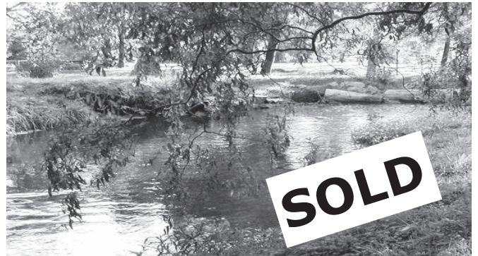
BUXTON $425,000 RIVERFRONT DELIGHT – GONE FISHING !

Develop your own slice of Paradise. The Steavenson River forms the rear boundary of over 130 metres. Lush Fertile River Flats, Ideal for Most AG Pursuits. Town Water, Telephone and Power Available. New Post and Rail Entrance & New Fencing. Only a Couple of Minutes Walk to the Main Street. Great access to the National & State Parks. Walking Tracks, and all the attractions Marysville has to offer. Excellent Rural Investment.