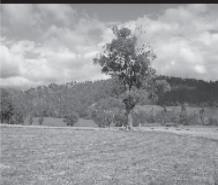
90 MARYTON LANE "Impressive Small Acreage"

This 25acre (app.) an ideal property for small scale or intensive farming pursuits. Property is well grassed and has an enviable 5meg. Water Right. New fencing & a well formed all weather road ensuring your privacy, 360deg. views. Inspect now to attain the properties full value.