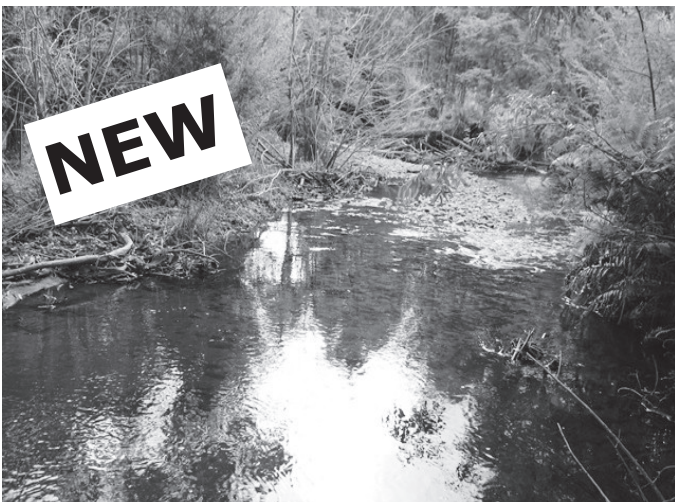
MARYSVILLE $340,000 River Front Diversity..Township Fringe VACANT LAND – 7.6 Acres

Flat to slightly undulating quality grazing land. Maroondah Hwy Frontage, Power & Tel. Available. Perfect portion of Native Bush and Pasture. 1 Large Dam. Excellent Access. All New Fencing. Established Boundary Tree lines. Many exciting house site options available. Surrounded by Multi-Million Dollar Properties Impressive Views in all Directions. 30 Mins to Healesville.