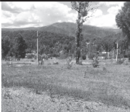
44 LYELL STREET "Prestige Views With This Property"

Million dollar views without the price-tag. Corner site of 1046sqm. (app.) on the high side of Lyell St. set amongst quality new homes. Walk to all that Marysville has to offer with Beauty Spot walk just steps away. Build your dream home here and enjoy the prestige views.