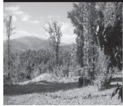
53/55/59 KINGS ROAD "Views, Views, Views"

Be captured by the views to be had from these 1000sqm (app.) properties set amongst quality homes, Marysville State Forest and many of Marysville's bush walks are within strolling distance. Buy one, two, or all three!!! VENDORS KEEN TO NEGOTIATE