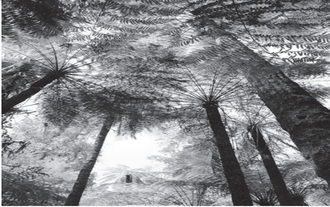
MARYSVILLE $159,950 Wilderness Oasis 15 Acres

Natural Forest with the most magnificent stand of Giant Tree Ferns. Sealed road frontage and internal access roads to House site and Dam. Well established walking trails . Telephone and Power available. Stunning views of Mt. Sugarloaf, the Cathedral Range & the Marysville Buxton Valley.