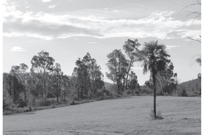
NARBETHONG $395,000 Impressive Property...Your Search is Over! 30 Acres

Natural Forest with the most magnificent stand of Giant Tree Ferns. Sealed road frontage and internal access roads to House site and Dam. Well established walking trails . Telephone and Power available. Stunning views of Mt. Sugarloaf, the Cathedral Range & the Marysville Buxton Valley.