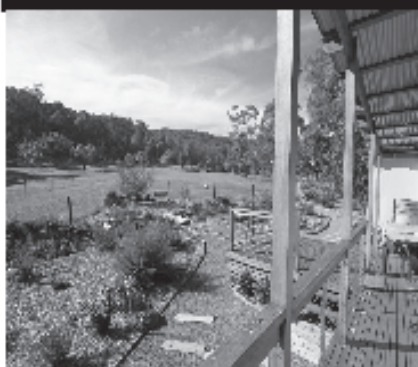
1556 MAROONDAH HIGHWAY "Potential Plus"

3.8ha property is ripe for further development (STCA) of cottages and the maturing of lavender plants. Well designed 2BR cottage huge decks & magnificent views from huge decks. Water is well catered for with 3 tanks & 2 two dams. Plenty of room here to extend.