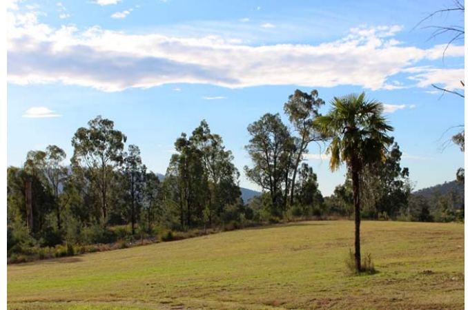
NARBETHONG $395,000 Impressive Property...Your Search is Over! 30 Acres

Natural Forest with the most magnificent stand of Giant Tree Ferns. Sealed road frontage and internal access roads to House site and Dam. Well established walking trails . Telephone and Power available. Stunning views of Mt. Sugarloaf, the Cathedral Range & the Marysville Buxton Valley.