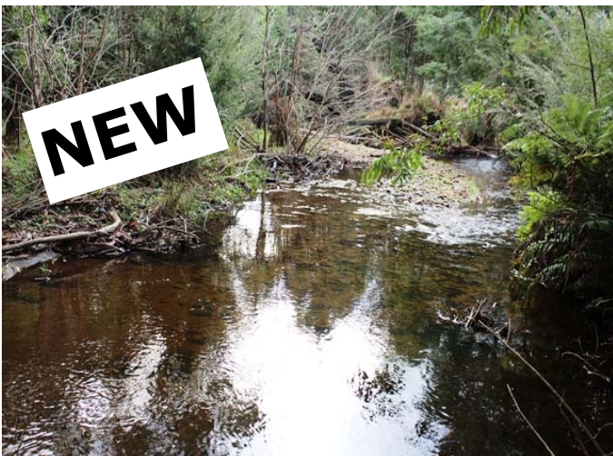
MARYSVILLE $340,000 River Front Diversity..Township Fringe VACANT LAND – 7.6 Acres

Flat to slightly undulating quality grazing land. Maroondah Hwy Frontage, Power & Tel. Available. Perfect portion of Native Bush and Pasture. 1 Large Dam. Excellent Access. All New Fencing. Established Boundary Tree lines. Many exciting house site options available. Surrounded by Multi-Million Dollar Properties Impressive Views in all Directions. 30 Mins to Healesville.