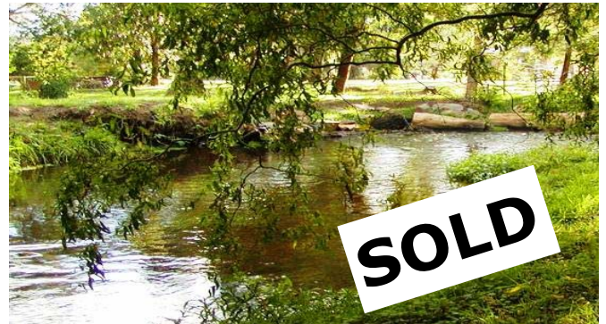
BUXTON $425,000 RIVERFRONT DELIGHT – GONE FISHING !

Develop your own slice of Paradise. The Steavenson River forms the rear boundary of over 130 metres. Lush Fertile River Flats, Ideal for Most AG Pursuits. Town Water, Telephone and Power Available. New Post and Rail Entrance & New Fencing. Only a Couple of Minutes Walk to the Main Street. Great access to the National & State Parks. Walking Tracks, and all the attractions Marysville has to offer. Excellent Rural Investment.