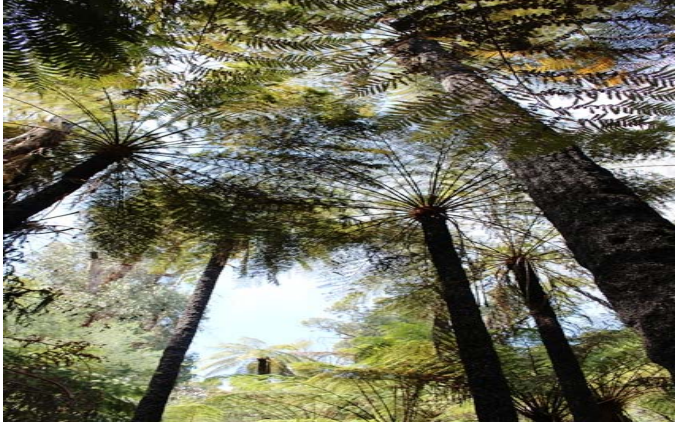
MARYSVILLE $159,950 Wilderness Oasis 15 Acres

Natural Forest with the most magnificent stand of Giant Tree Ferns. Sealed road frontage and internal access roads to House site and Dam. Well established walking trails . Telephone and Power available. Stunning views of Mt. Sugarloaf, the Cathedral Range & the Marysville Buxton Valley.