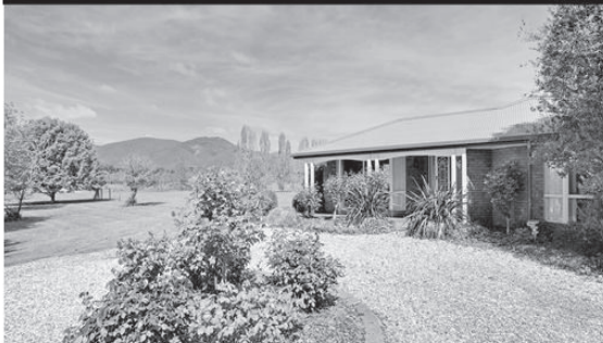
785 Back Eildon Road EILDON

Situated on 5.4 acres approx. Comprising 3/4 brms, 2 bath, 2 zoned living areas, central kitchen and family room, games room or office, separate dining room, sitting room/4th brm, and laundry. The views from every window are lovely. An American barn and large shed provides shelter for boats, caravans, or workshop. A bore and three tanks provide water to the property. This is a quality lifestyle package.