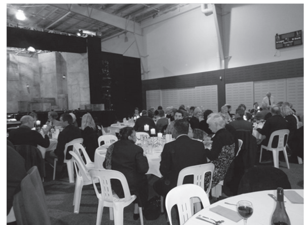
Above: Some of the patrons before the show Top: "Curtain Call" with most of the cast.