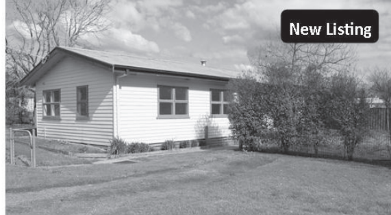
77 Nihil Street ALEXANDRA

Features 3 bedrooms, lounge room with solid fuel heater and split system. Large kitchen has plenty of cupboards and bench space, electric upright stove with an adjacent meals area. The bathroom is in reasonable condition and boasts a shower over the bath and new vanity. There is a separate toilet. Outside the property has a garage and workshop. All of this is situated on a great corner allotment with good fencing.