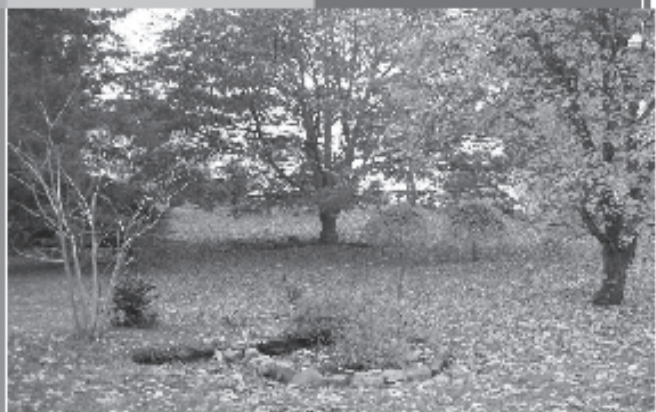
3 KEPPEL'S CRT, MARYSVILLE $195,000

Are you downsizing, buying a holiday home, 1st time property buyer, entering the rental market, THEN THIS IS THE ONE FOR YOU!! North facing, open plan liv/din/kit, 3 BR all in this light filled home. Huge deck for your outdoor entertaining is huge, built to take advantage of the magnificent mountain views and established gardens.