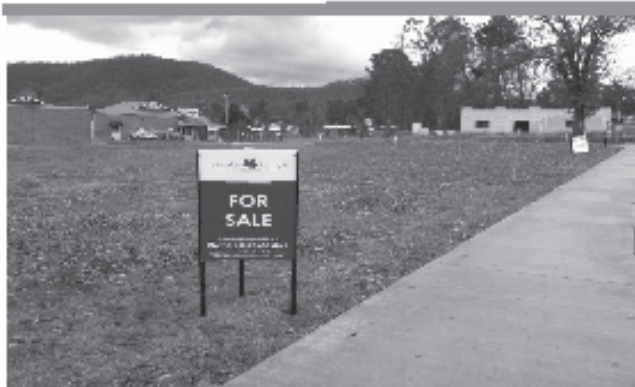
1 PACK ROAD, MARYSVILLE $195,000

SUBDIVISION POTENTIAL—3200sqm. (approx.) Ready for subdivision with the hard work already done for you. Survey plans, fencing, driveway already completed. Build on one and keep the other for investment or retirement. Build on both with B&B's (STCA). Garden ablaze with Autumn colour, terraced gardens, dry stone walls, tree ferns and huge maples.