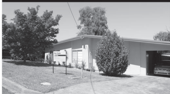
16 Villeneuve Street ALEXANDRA

Four large bedrooms 2 with built-in robes, with the main bedroom featuring an ensuite, three spacious living areas, comprising a lounge room with air-conditioning, family room with solid fuel heater and a separate formal dining room or second lounge room for the kids. The kitchen is adjacent the lounge area and is designed to make family meals a delight to prepare.