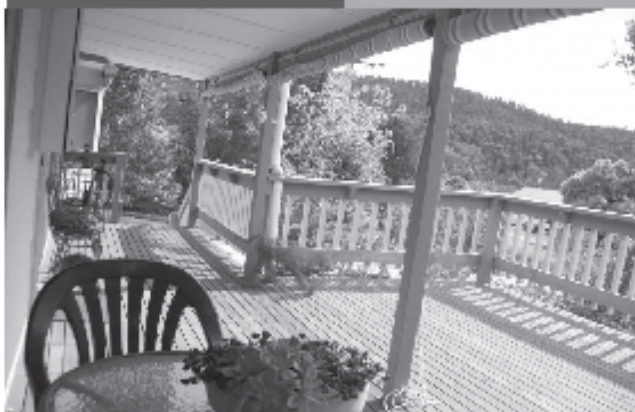
12 DARWIN STREET, MARYSVILLE $295,000 to $320,000

PHONE 5963 4491 - JENNY ON 0408 100100 590 - DIANNE ON 0419 518