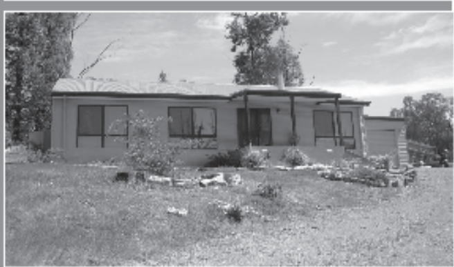
23 ALLISON CRES, MARYSVILLE $340,000

PRIME COMMERCIAL LAND IN THE HEART OF MARYSVILLE 377 sqm. (approx.) . Located opposite the Marysville Bakery, Post Office and next to the Marysville Patisserie and close to the Visitor Information Centre. Ideal location for any tourism venture.