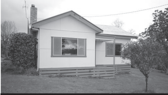
48 Cooper Street ALEXANDRA

Just a short walk to the township of Alexandra, local hospital and all other important amenities. The home comprises of 3 bedrooms, large lounge room with split system, original kitchen with plenty of cupboards, bench space with room for dining and an electric stove upright stove. Outside the property has numerous sheds, including a lock-up garage. Situated on a massive allotment of approx. 1008 sqm.