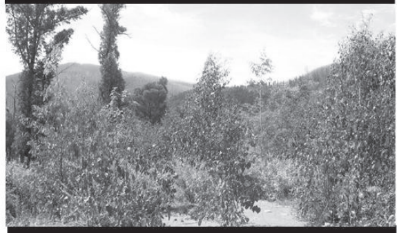
63 King Road, MARYSVILLE

Some of Marysville's most prestigious homes have been built in this precinct. Uninterrupted views of the ever changing Mystic Mountains. Close to the state forest and its wildlife. Build your dream or holiday home and be sure that your view will not be interrupted. 900sqm Approx.