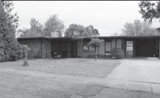
39 Bon Street ALEXANDRA

With only a 10 minute walk to the main street, schools and footy oval, this property is one of convenience. Constructed of brick, with good fences and ideally located on a corner block makes this 3 bedroom, 2 bathroom home low maintenance. The lounge is spacious and adjoins the kitchen and neat meals area. The home currently rents for $275 per week so it clearly makes an ideal investment.