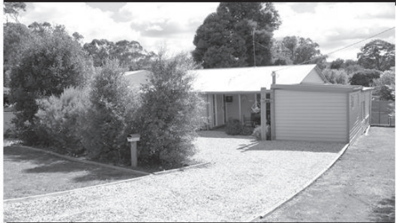
55 South Crescent, EILDON

From the moment you enter this tastefully renovated split level home you'd never suspect its humble beginnings. Set on 550sqm (approx.) this original miners cottage has been lovingly transformed into a wonderful family home. Comprising 3 bedrooms, one with direct access to a delightful deck, 2 bathrooms, sep. private sitting area, huge galley kitchen which comfortably accommodates a dining table, open spacious lounge with wood fire and air-cond.