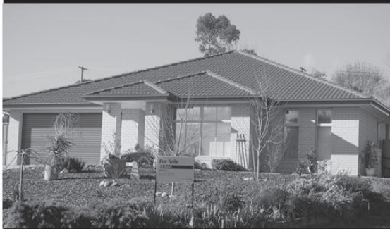
91 Webster Street ALEXANDRA

Imagine yourself being able to unpack and settle in to an as new home without having to change a thing. Waiting for you is this beautifully presented and well cared for 3 bedroom, 2 bathroom, 2 living zones family home. Featuring: main bedroom with ensuite and WIR, 2 bedrooms with BIR's, open plan modern living room (with split system), well appointed kitchen with walk in pantry and dishwasher, formal lounge room, walk in linen press, and a double lock up garage.