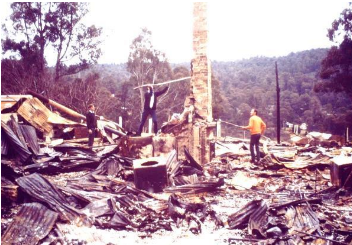
Photo of Trevor Harrow trying to push over the chimney with Gus on the left and Len Norman on the right.

Sadly in 1969 Kerami burnt down. The manual telephone exchange cards 1 give N Evans at Kerami, Cumberland Road phone No 157.