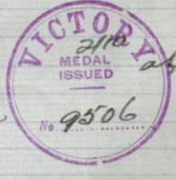
NAA: B2455, COOK T R -- page 33