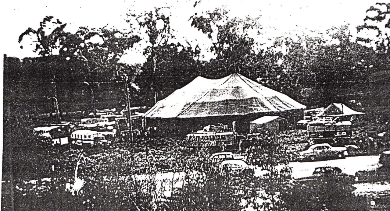
The Circus comes to Eltham - the view from Grace Mitchell's shop

OPEN DAY - 10 A.M. TO 4 P.M. SATURDAY, 27 MARCH