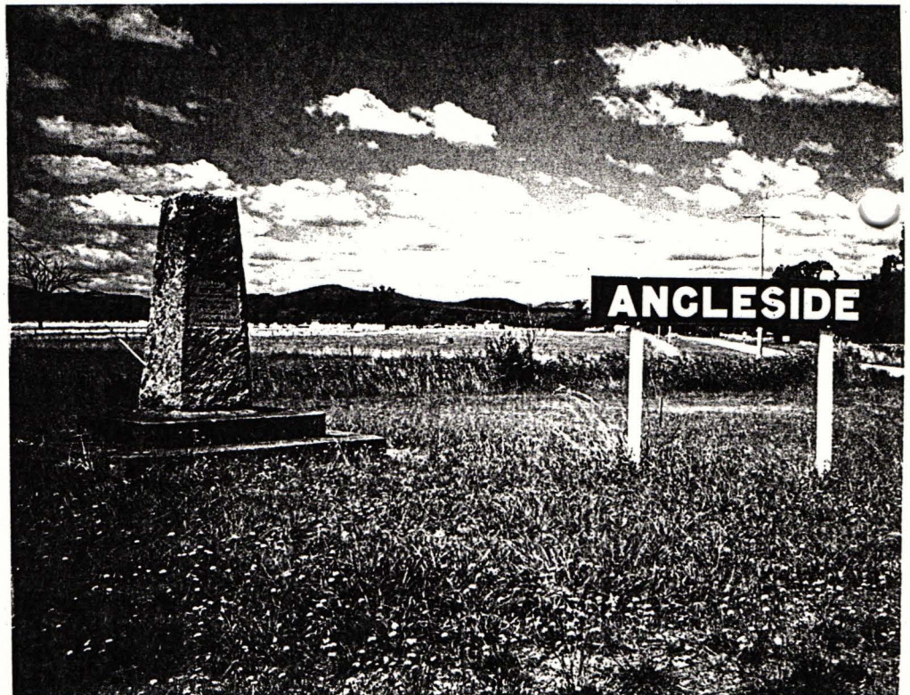
HUME & HOVELL MONUMENT AT ANGLESIDE IN NORTH-EASTERN VICTORIA