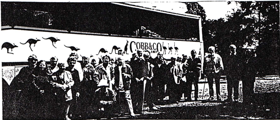
Spring Excursion Group, Kangaroo Ground

6.30 PM WEDNESDAY 11TH DECEMBER 1996 ELTHAM SENIOR CITIZENS' CENTRE BUFFET DINNER AND MYSTERY EVENING