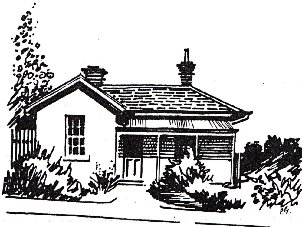
OLD POLICE STATION ELTHAM .