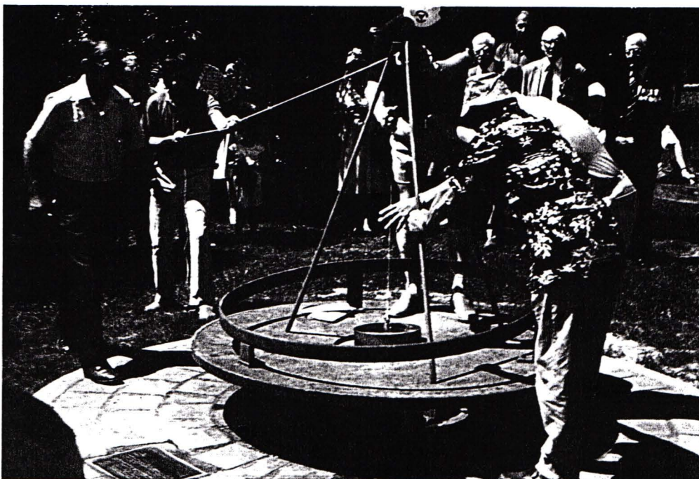
SOCIETY MEMBERS LOWERING THE TIME CAPSULE INTO THE BASE OF THE MONUMENT OUTSIDE THE ELTHAM COMMUNITY CENTRE AS PART OF VICTORIA'S 150TH ANNIVERSARY CELEBRATIONS IN 1985.