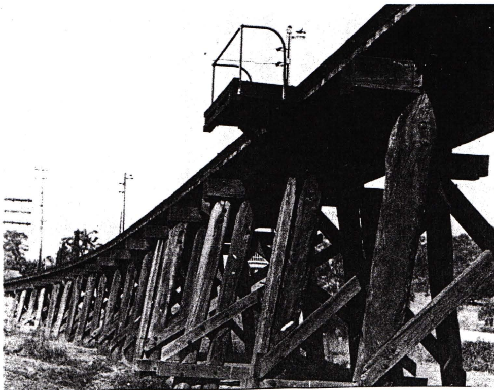
ELTHAM RAILWAY BRIDGE