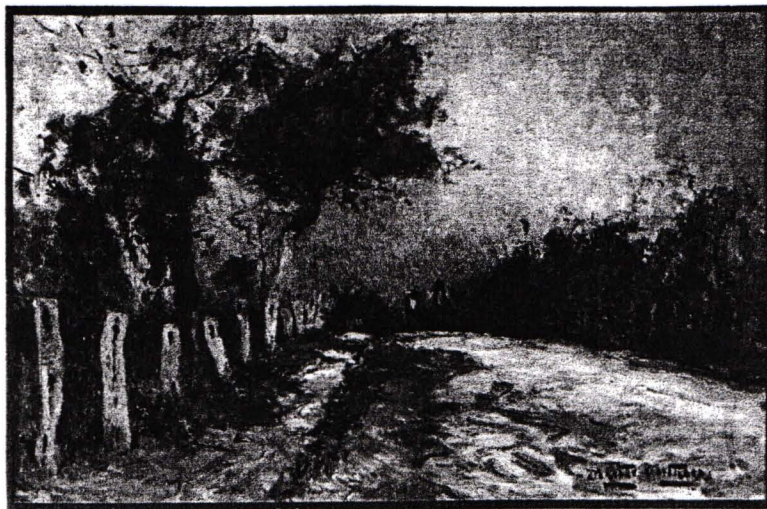
COUNTRY ROAD By Walter Withers From the National Gallery of Victoria collection One of the paintings featured in the extended Heidelberg School Artists' Trail

Nominations should be signed by two members of the Society and accompanied by the written consent of the candidate. If insufficient nominations are received further nominations shall be received at the meeting. However, it should be noted that where a valid prior nomination is received it will have priority and no nomination for that position can be accepted at the meeting.