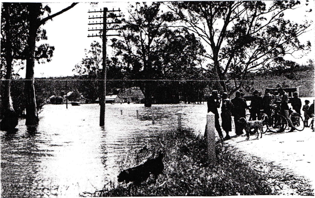
Diamond Creek floods, Eltham South 1934

The Spring excursion along the creek was curtailed in length due to poor attendance. For those who were not able to attend, this meeting presents an opportunity to become acquainted with scenes of early years and the present day along the Diamond Creek.