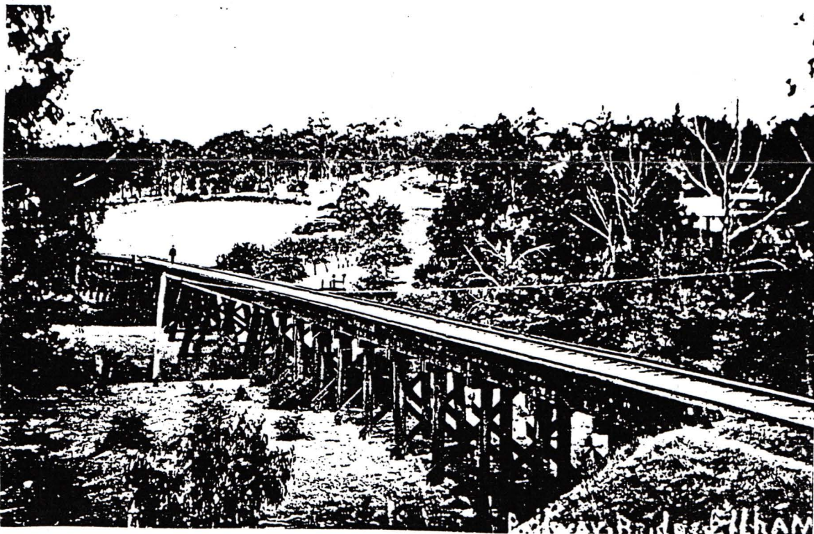
Eltham Railway Bridge prior to electrification in 1923

Remember, this coming June 5 is the 100th Anniversary of the Opening of the Line from Heidelberg through Heidelberg North, Macleod and Greensborough to Eltham.