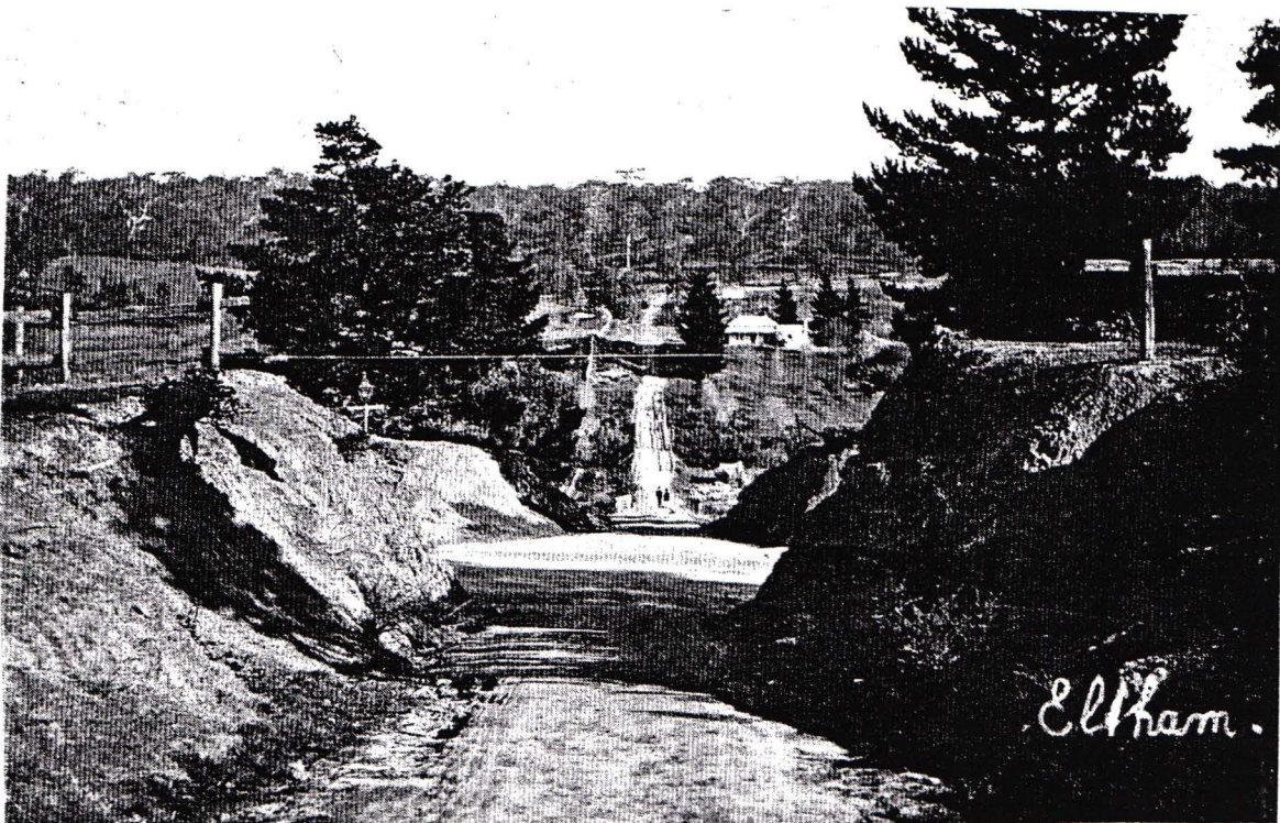
Bridge Street looking westerly across Main Road.