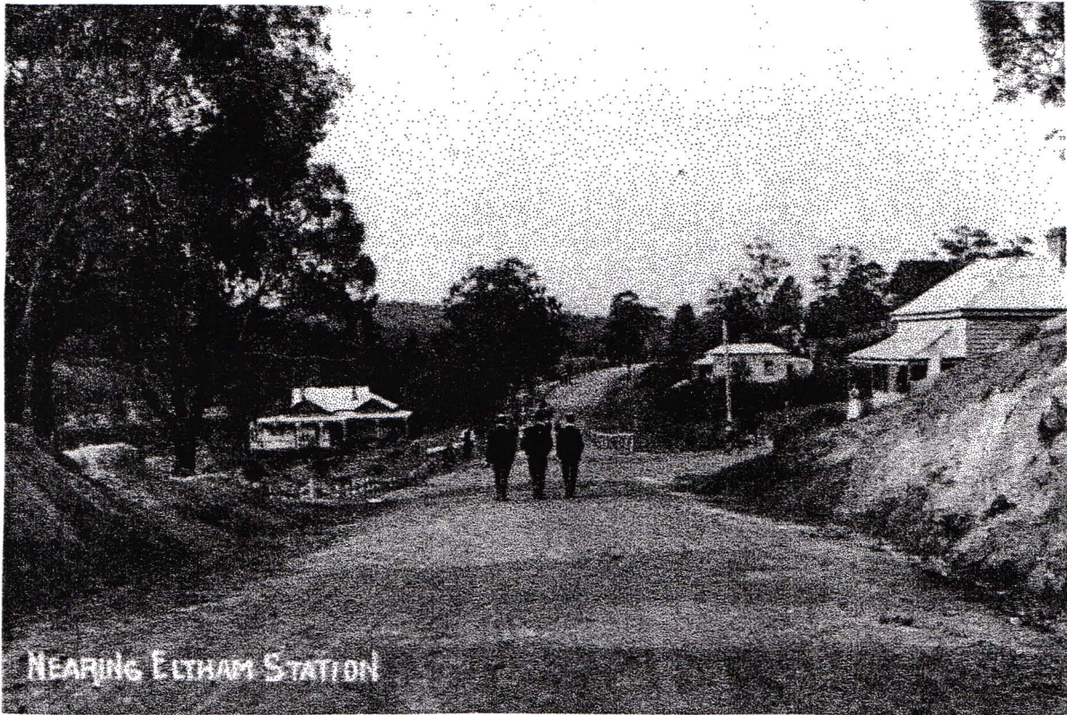
Main Road looking northerly from near Bridge Street.

Photos from the Society's collection in this Newsletter show early views around Main Road, Eltham which features in Jock Read's recollections.