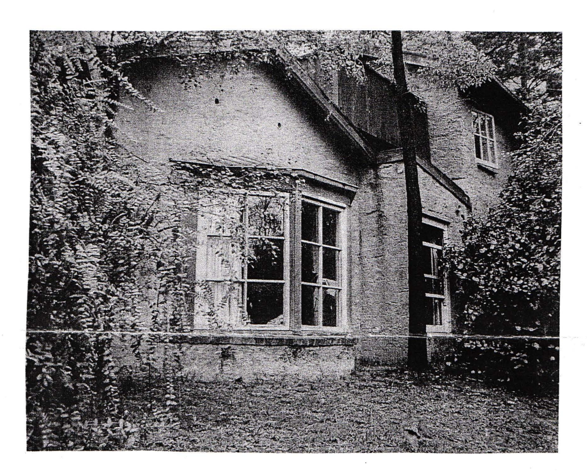
Another view of Fulling