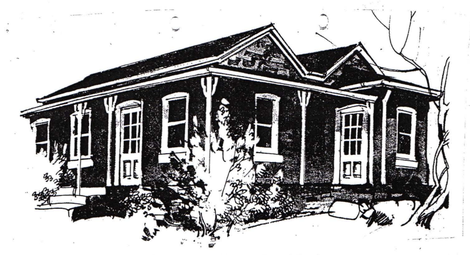
Wingrove Cottage from a 1970s sale brochure..

SPECIAL GENERAL MEETING CONSIDERATION OF LIFE MEMBERSHIPS