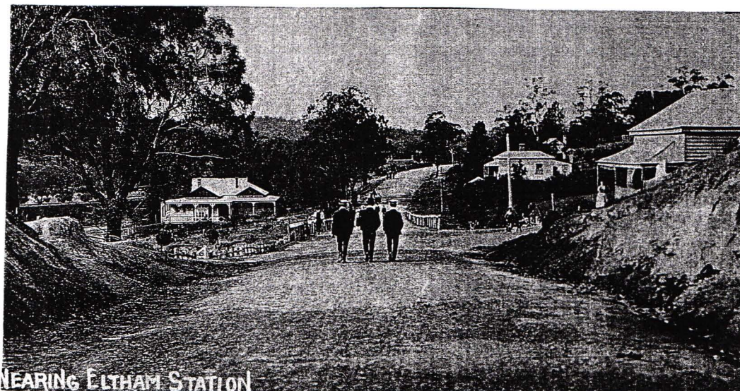
NEARING ELTHAM STATION