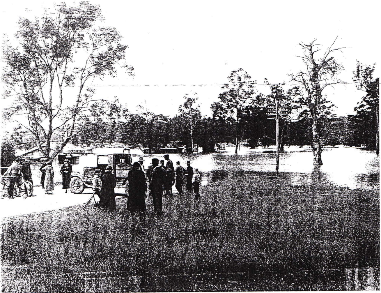
The 1934 Diamond Creek flood at the corner of Falkiner Street and Main Road. The bridge referred to in Harold Bird's story is in the right background. The dark shape in the water just to the left of the telegraph pole is the roof of Monteith's bus.