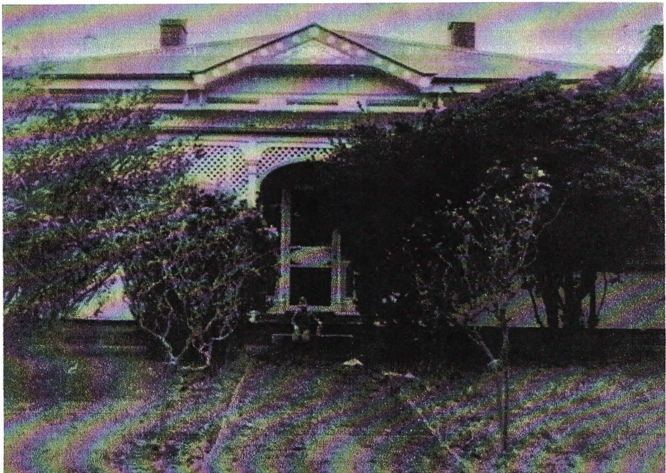
Edendale Farm and the homestead in the 1930s The top view is taken from the present day Coleman Crescent