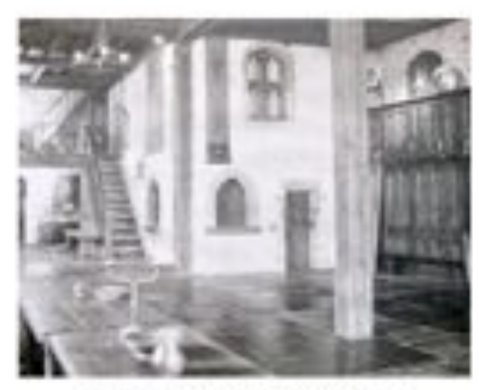
The Great Hall Montsalvat

2PM SUNDAY 14th NOVEMBER ELTHAM CEMETERY VISIT