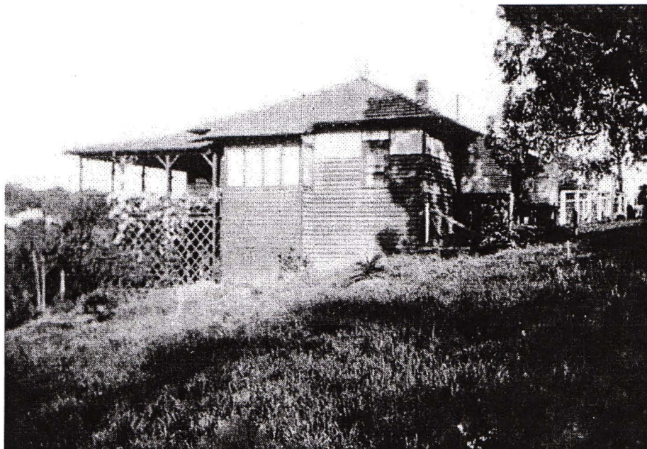
The North house 'Tralford' later Meruka House