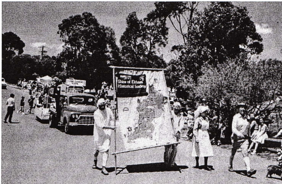
Our Banner in the 1989 Eltham Festival Parade