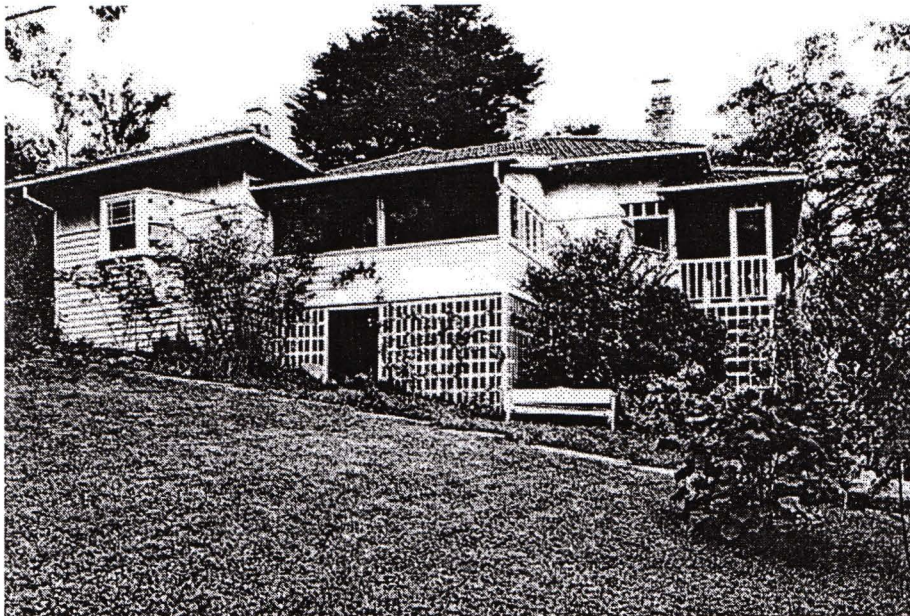
Glen Ellen Homestead