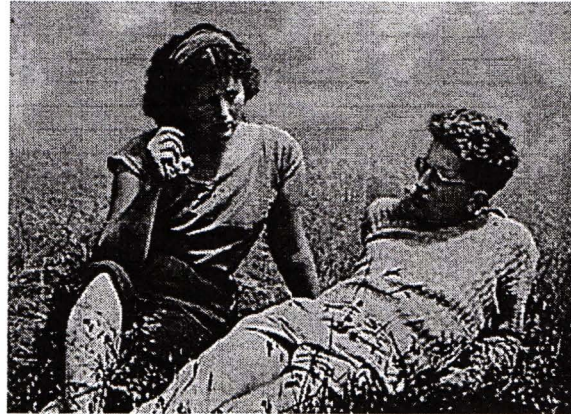
From the cover of 'Memoirs of a Young Bastard'