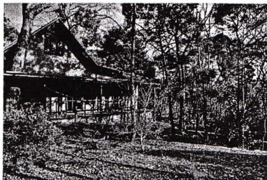
The Laughing Waters property