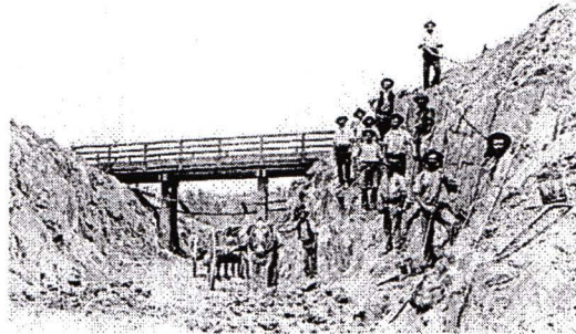
Men working on construction of the railway to Eltham

On the 25 th January 1901 such was the explosion at this construction site that the residence of Mr Walter Withers nearby was damaged. A local newspaper ran with this 'local' item: