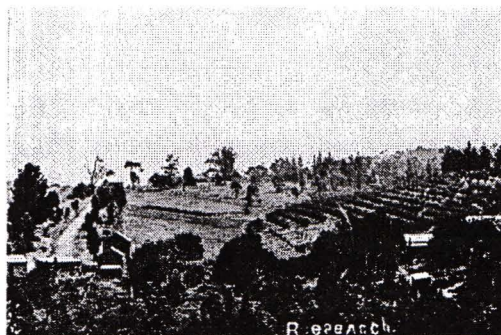
Research looking north up Ingrams Road

To celebrate the Centenary of the Shire of Eltham in 1971 one of the many projects initiated by Eltham Council was a collection of historical photographs of the Shire. This collection of more than 600 photos comprised mainly originals loaned by residents that were then professionally copied before being returned to the owners. From this collection the illustrations in the centenary history of the Shire, "Pioneers and Painters" by Alan Marshall, were selected.