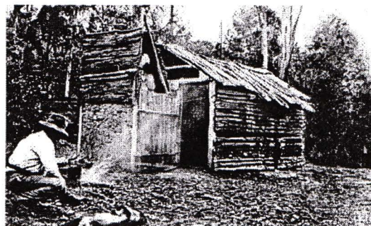
A miner's hut, Christmas Hills

On the initiative of our Society the collection was transferred to the Eltham Library where it was more accessible to the public. Over intervening years the photos have proved popular with school groups visiting the library and for research by students. About 150 of the photos have been digitised and can be accessed through the Yarra Plenty Regional Library (YPRL) website or the Victorian Collections website.