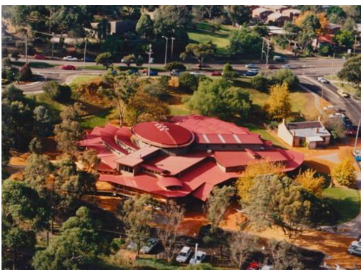
Aerial view of Eltham Library - 1994

anniversary of this opening will be a family day of celebrations at the Library for children and adults, including art tours, a Punch and Judy puppet show, farm animals, a treasure hunt and balloon sculptures.