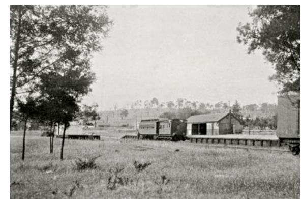
Eltham Railway Station c1912

The walk is about 3 km in length and will take about 2.5 hours. It will start at 2 pm at the Eltham Railway Station car park (east/Main Road side) (Melway Ref. 21 J5). Some of the route is over rough ground so solid footwear is recommended.