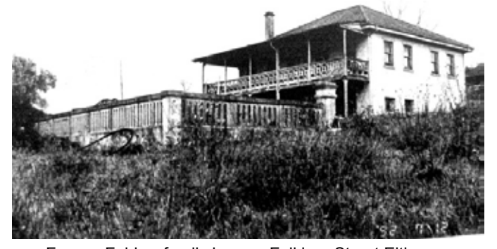
Former Fabbro family home - Falkiner Street Eltham

As part of our strong support for this naming we advised Council we considered the property to be historically important as an example of the former market gardens that were once common along the waterways of the district. Research indicates that the property was used for market gardening purposes from the 1860s until 2007.