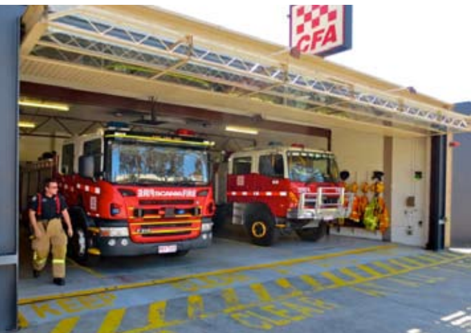
Eltham Fire Station c1960