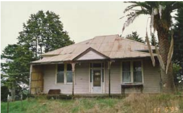
Murray's farmhouse 1993 (now demolished)

The history of this farm includes its transition from orcharding to dairying to beef cattle and ultimately to residential subdivision. The creek area includes the features now known as Murrays Wetlands and Murrays Bridge, the former farm crossing of the creek, now adapted for pedestrian and bicycle use.