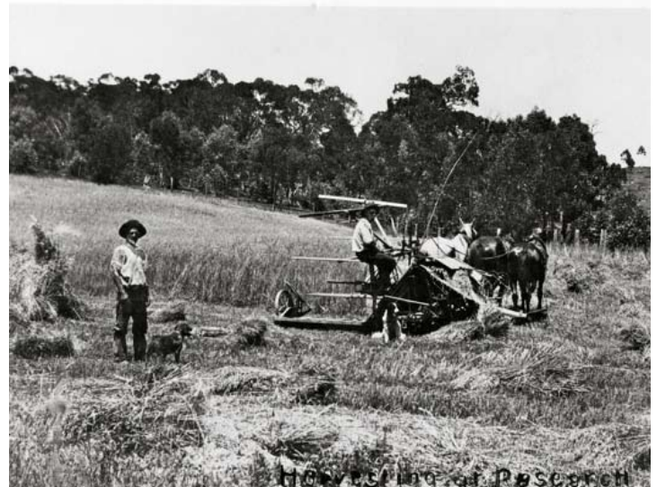
Harvesting at Research