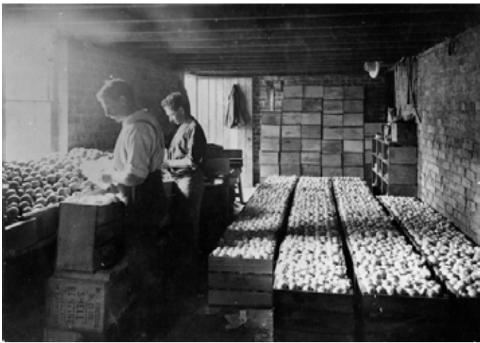
Packing apples at Hurstbridge