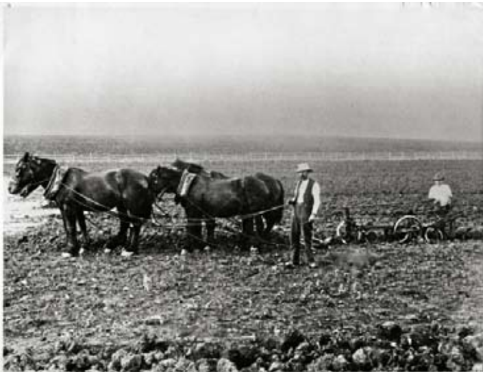
James and Robert Ness - Garden Hill Farm, Kangaroo Ground

Early farming accompanied those mining activities and grew with the decline in the gold mining. Stone fruit (peaches, plums and apricots) and pip fruit (apples and pears) for the local domestic market was carted to Melbourne by wagon or sent by train from Diamond Creek and from Hurstbridge when the rail line was extended to the latter, largely for that purpose, in 1912. Early developments in the Eastern area of the Shire, particularly with vegetables and vines on the rich basalt soil that caps 'Garden Hill' in Kangaroo Ground, were difficult to sustain partly due to lack of water.