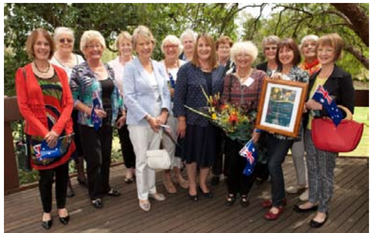
Eltham Rural Group - 2015 Nillumbik Community Group of the Year

Diverse organisations and projects have benefitted from receiving ERG funds since inception and some recent ones include Allwood Neighbourhood House, Andrew Ross Museum, Banksia Palliative Care, CFA brigades throughout Nillumbik, Eltham Foodshare, Araleun, Diamond Valley Community Hospital and the Royal District Nursing Service. ERG also supported the Blacksmith Tree project at Strathewen commemorating the people and communities so tragically affected by the bushfires in February 2009.