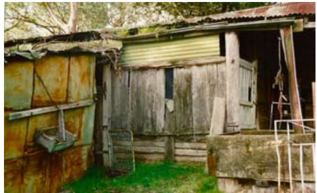
Slab barn - Murray's Farm photographs

For our excursion on 2nd May we intend to walk around the creek parkland and discuss the history of this farm and surrounding area. At the conclusion of the walk there will be the opportunity to drive to the location of the former Murray house for views over a large area of the farm.