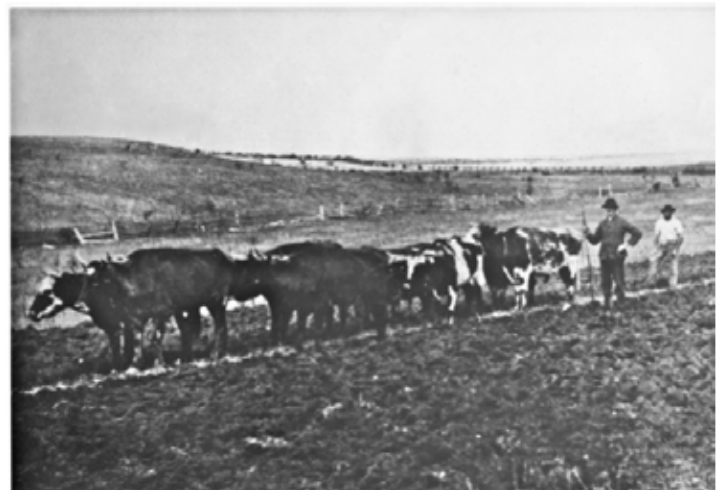
Bullock teams on Ellis's Farm, Kangaroo Ground