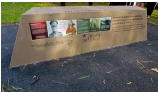
Interpretive signage plinth at Hurstbridge

Signage has been provided on low plinths at the Hurstbridge Memorial Park in Greys Harps Road, Hurstbridge, adjacent to the recently renovated Christmas Hills War Memorial and at the Kangaroo Ground Memorial Tower. Each installation carries its own community's spirit and stories based on historical information. Area identification signs have also been provided at the Eltham and Hurstbridge Avenues of Honour.