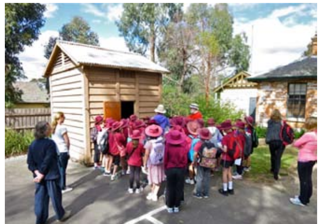
Grade 3 Eltham Primary School students at the lock up

It is encouraging to see the interest shown in local history by teachers and our younger generations. Squeals of delight would also appear to indicate the children enjoy being 'locked up' in the lock up.