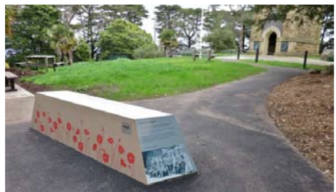
Interpretive signage at Kangaroo Ground Memorial Tower