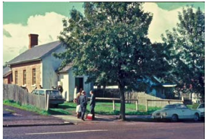
Eltham Courthouse c1970

So, there have been many changes in the last 45 years, Woolworths now owns Safeways, the Eltham Court is closed, as has the old Eltham swimming pool, the 'new' Eltham Leisure Centre is just about to be extended and refurbished, the shires of Diamond Valley and Eltham no longer exist and sadly we have lost many more significant people from our community.