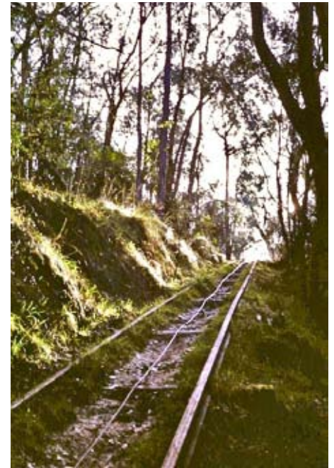
The railway (near the top) in 1968

At the top of the track is a sumptuous, immaculately-maintained mansion called Treetops. It was built in about 1910 and restored in the late 1980s; an extension was added in around 1999. A separate outbuilding providing self-contained accommodation was built in the 1950s, when landscape gardening and other external features were also added. The owner in the late 1980s was singer/songwriter Mike Brady (of Up There Cazaly fame) who added a modern garage designed by Alistair Knox (or possibly by Alistair's son Hamish). Treetops has changed hands four times since then: it was sold in June 2014 for $2.2 million, and again in December 2015 for an undisclosed amount.