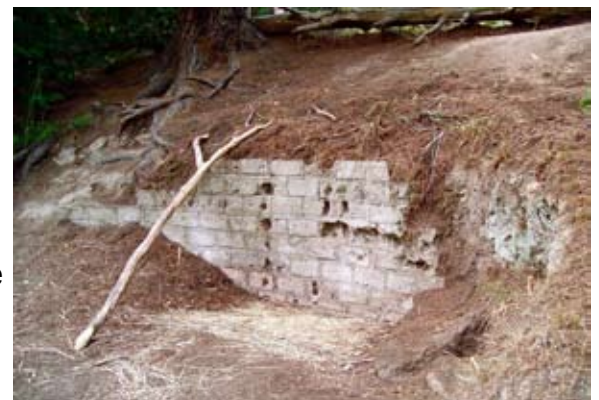
The mystery wall

The neighbouring property to Treetops (downstream) was called Griffith Park. It included a tennis court, with a palm tree in each corner, situated on the river flats. Its legacy is a very level section of ground beside the walking track. Immediately below this site, almost at the river's edge, can be found two fragments of a wall. The slight curvature suggests that it wasn't part of a building, yet it seems too ornate to have been a mere retaining wall. My guess is that it formed the back of a riverside viewing platform or mooring platform.