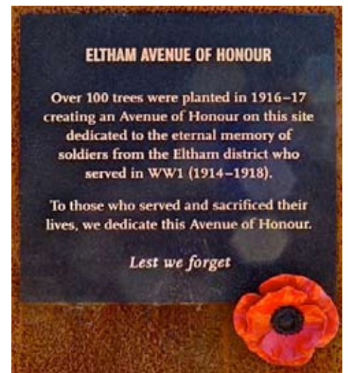
Part of the new Eltham Avenue of Honour memorials in Main Road

This free walk is open to the general public as well as Society members. Dogs are not permitted on Society excursions. The phone number for contact on the day is 0409 021 063.