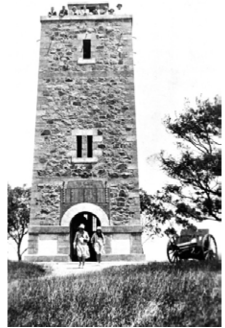
Kangaroo Ground War Memorial c1929

The whole tour (72 miles) is over good roads, and the run is made memorably delightful by the visit to the Eltham War Memorial.