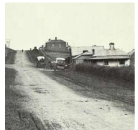
The Evelyn Observer building on the hill at Kangaroo Ground