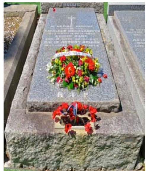
Wallis Family Grave photograph - Jim Connor

The 110th Signal Squadron was raised in 1966 as part of the 2nd Signal Regiment to provide communication support during the Vietnam War. Squadron members remained in Vietnam until 1972, when they returned to the Regiment at Watsonia Barracks in Melbourne.