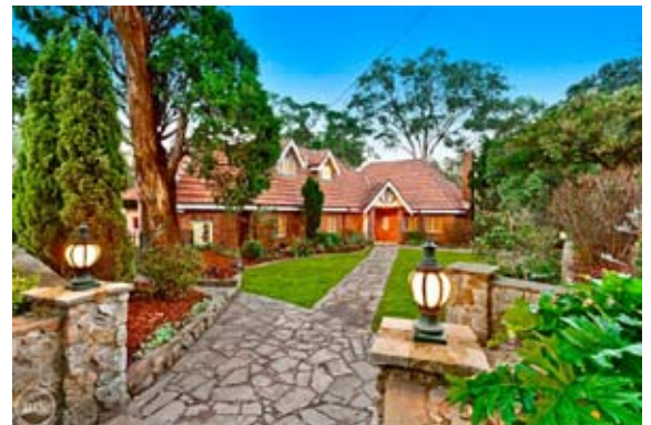
Treetops in 2015 - from real estate information

Originally, Treetops extended all the way down to the river, though the bottom portion is now public land. The railway line was constructed on the property in about 1930 as a sort of slipway for boats, which were winched down to the water from a shed near the house. The locals would gather for boating parties. (I take "boating party" to mean a pleasure outing involving several boats, rather than "partying".) The top section of the line is still intact, and the rusted frame of a trolley can even be seen, as well as gear wheels from the winch. The railway was no longer in use by 1966 (but may have closed somewhat earlier).