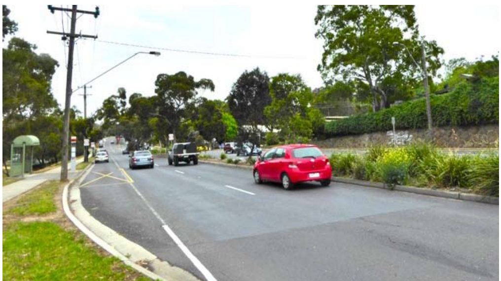
Digital photograph 2015

.....I personally prefer the old Eltham.