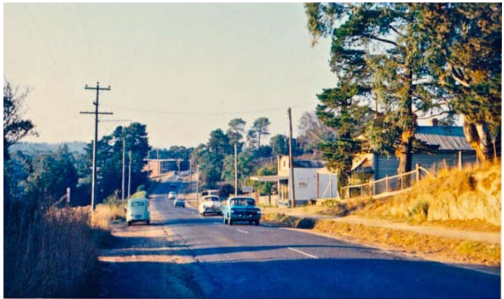
Colour photograph c.1967

About 1967 I endeavoured to take the same view as seen in the colour photo. Rosemary's little Ford Prefect is parked on the left side of the road. The brick building is actually the 'new' Shire Office located on the former site of Shillinglaw Cottage, which had just been moved a little way south.