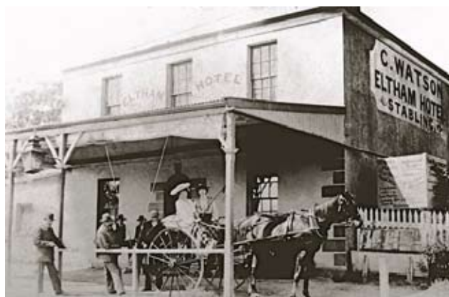
Watson's Eltham Hotel

Opposite the Eltham Hotel a vacant site, also on a corner of Main Road and Pitt Street, is a vague reminder that another hotel once stood there, until burnt down in 1931.