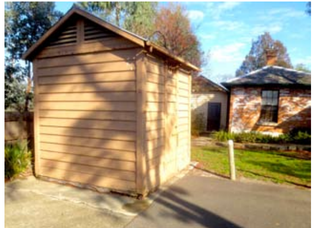
Timber Lockup at rear of the Local History Centre

The timber lockup was relocated from Youth Road in Eltham in March of 2001. It is believed to have been used by the Council, probably for storage, but its original location is unknown at this stage.