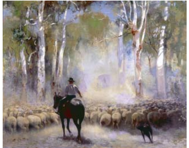
'The Drover' by Walter Withers Painting held in the Bendigo Art Gallery