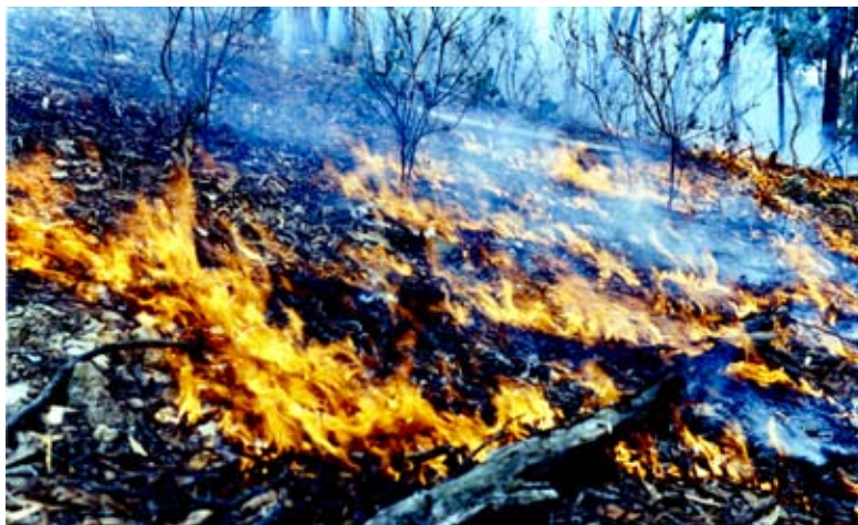
A Controlled Burn on the Co-op

There are 24 houses on the Co-op. spread between the 3 access roads into the property, eight as yet are still unbuilt. A shareholder is entitled to 1500 squ. metres for a house site. This is leased to the member under the rules of the Co-op. and must contain the house and any ancillary buildings plus the garden site. The garden site can be used for non-indigenous plants for food or decoration as long as they do not spread into the bush as weeds e.g. Plum trees, Passionfruit etc.