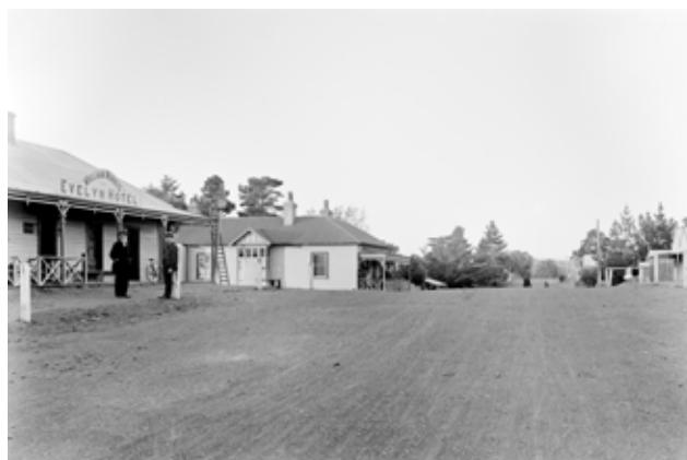
The Evelyn Hotel