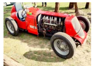
The Kleinig Hudson Special