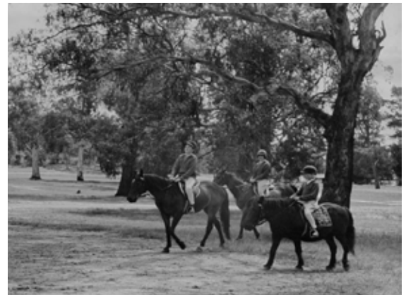
Eltham Lower Park

The park will be the venue for our July excursion which will comprise a walk of about 3.5 km around the park and adjacent areas. Along the way we will discuss the history and natural history of the area. The path along the creek and the river provides a pleasant and scenic walk.