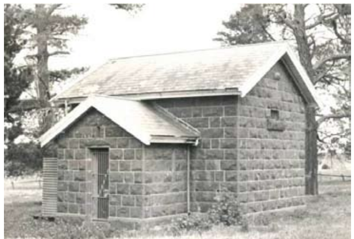
Bannockburn Lockup - similar to the Eltham Lockup