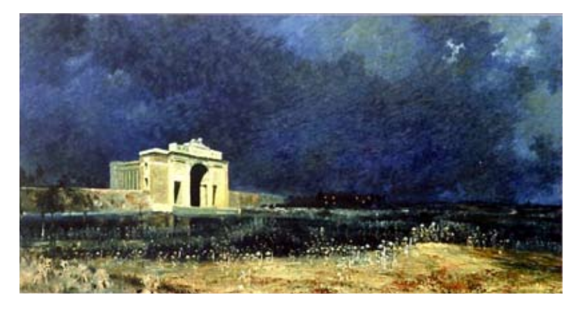
Menin Gate at Midnight - painting by Will Longstaff

There was an art exhibition in the gallery space of the church and in the hall a