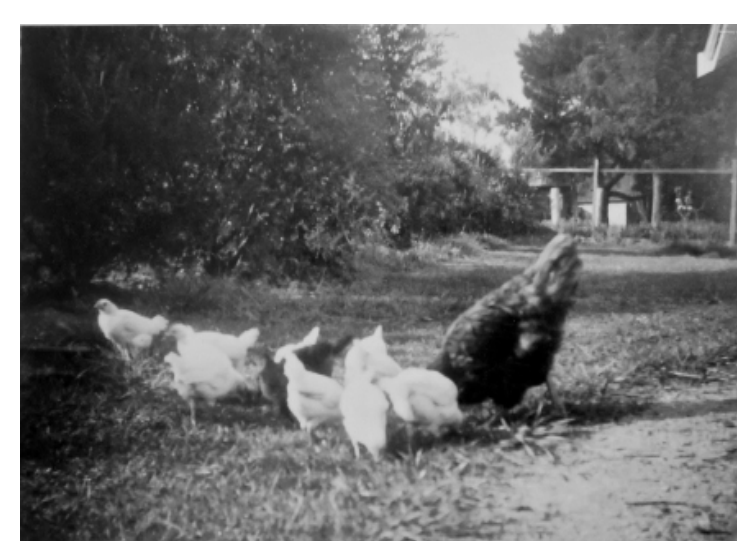
Henry and his six wives

"Goodness," said my brother who suffered somewhat from living in an all female house. "Imagine if they all talked at once, it would be an awful noise."