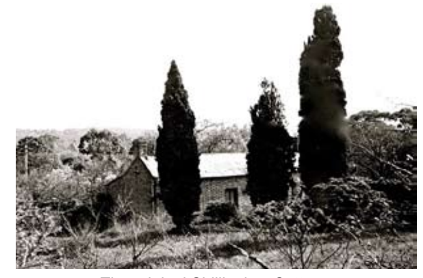
The original Shillinglaw Cottage Photograph - Shire of Eltham Pioneers collection

This free walk is open to the general public as well as Society members. Dogs are not permitted on Society excursions. The phone number for contact on the day is 0409 021 063.