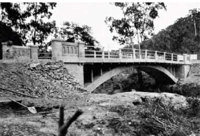
Official opening of the Monash Bridge on 3rd November 1917