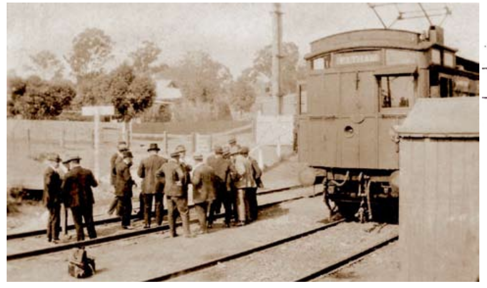
First electric train to Eltham 1923 - EDHS collection - Photograph from a scrapbook belonging to Heather Jenkins who lived at 728 Main Road, Eltham as a child