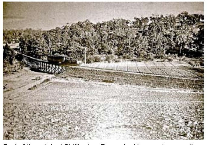
Part of the original Shillinglaw Farm - looking west across the railway line - photograph - EDHS collection