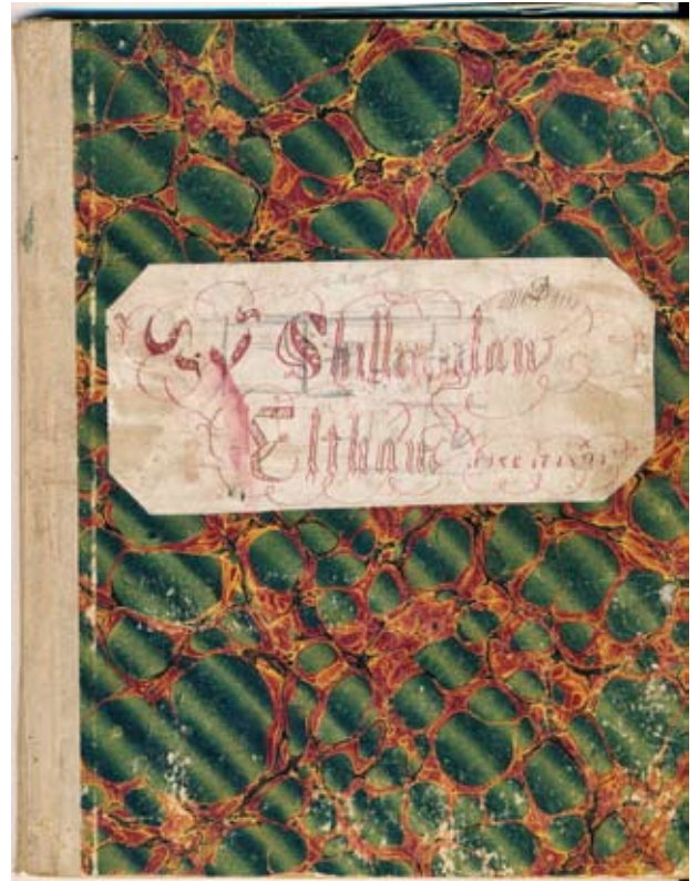
William Shillinglaw Homework Book Photograph

The homework book covers a two-month period from mid-June to mid-August 1890. Homework was given on most days, generally consisting of a few questions requiring only brief answers. Subjects covered were grammar, arithmetic, history, geography and natural science. The exercises all seem to be indicative of rote learning, with little evidence of any creative ability being elicited. Other subjects taught would have included reading, writing, spelling and (for girls) needlework.