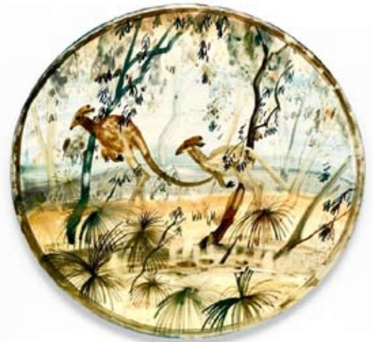
Kangaroo Platter c1950