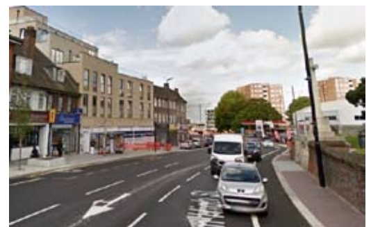
Eltham High Street - 2018 Photograph - Google Streetview