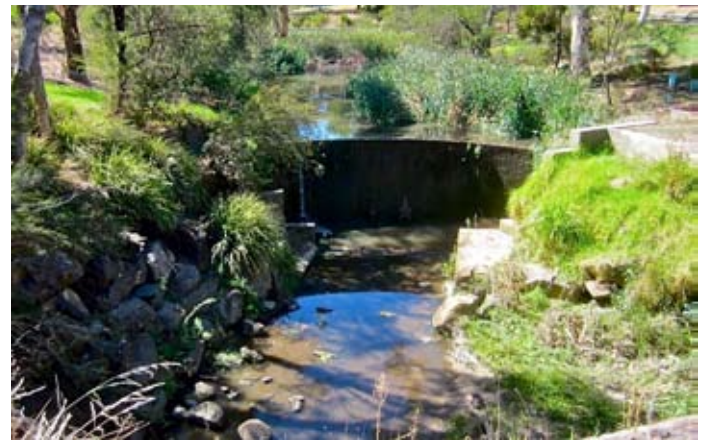
D.B Smith dam - Nerreman Park