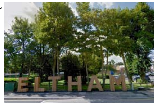
The Eltham High Street sign