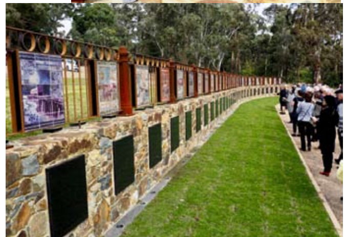
"Our Eltham – Artistic Recollections"