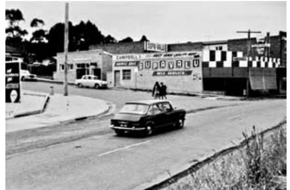
Corner of Main Road and Luck Street, Eltham 1968

A series of approximately 50 photos were taken in February 1968 by an unknown person of the section of Main Road planned for duplication, commencing at Pitt Street and travelling towards Research through the shopping centre, finishing at Elsa Court.