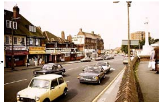
Eltham High Street - c1988