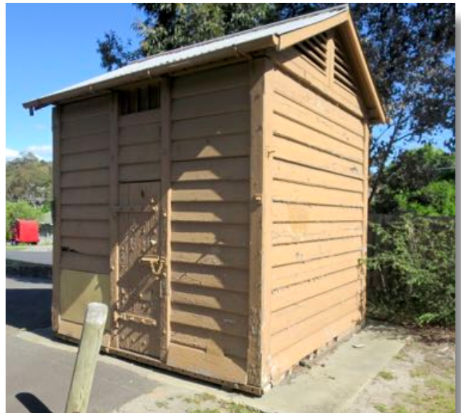
Lock Up prior to restoration Photograph - EDHS Collection

You can be reassured it is not now used to lock up people, though it was popular during pre COVID tours of the Justice Precinct by pupils from local primary schools, especially if they were able to lock their teacher up (for a very short time) after a mock trial in the courthouse. The pupils themselves also seem to delight in the reality of being temporarily enclosed inside the lock up, which may be a change for them so often experiencing life via a small screen.