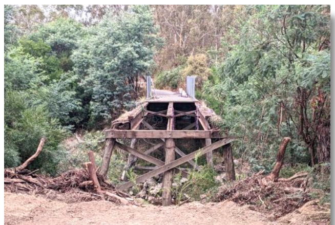
Murray's Bridge during demolition - 28 February 2022