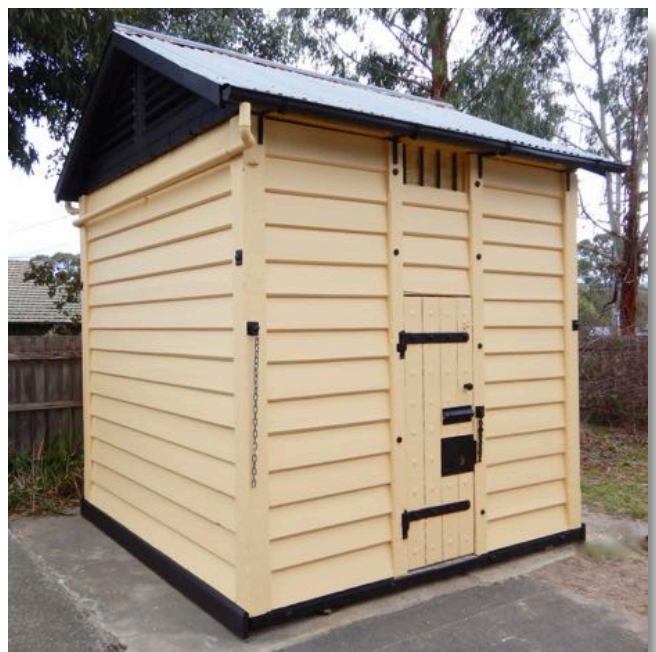
Lock Up after restoration - 2018 Photograph