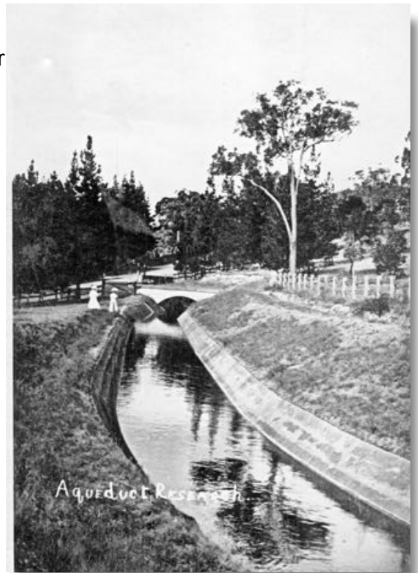
Maroondah Aqueduct at Research Photographer Tom Prior - * EDHS

This free walk is open to the public as well as Society members. Dogs are not permitted on Society excursions. The phone number for contact on the day is 0409 021 063.