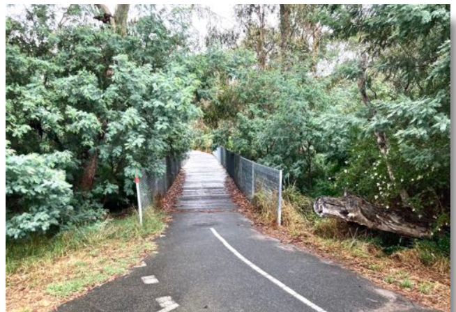
Murray's Bridge - 3 February 2022