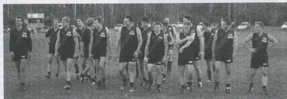
The boys walk off the ground satisfied after defeating Greensborough