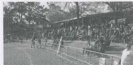
The biggest crowd in many years attended the interleague representative game at Eltham Central Park.