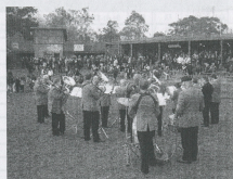
The Band overtook the Rep crowd at half time.

The Diamond Valley was pleased with our showing and so was the management of Eastern Football League. I would like to think that when the event returns to the diamond Valley in 2005 we will be a perfect choice to host the game again.