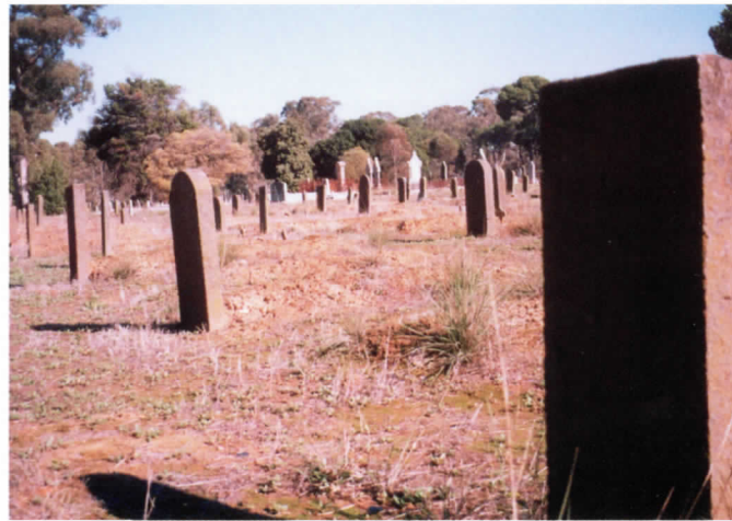
• Chinese Footstones at the White Hills Cemetery (above & above left).

The present site was initially towards the rear of the cemetery. It is now located just to the left of the main entrance.