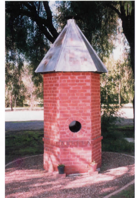
• Burning Tower at the White Hills Cemetery

The Burning Tower is used at funerals to burn offerings of paper clothing and money, and sometimes paper houses and cars so that the deceased would be provided for in the after life. The pathway which traverses the Chinese section at the White Hills was made in consultation with the Chinese.