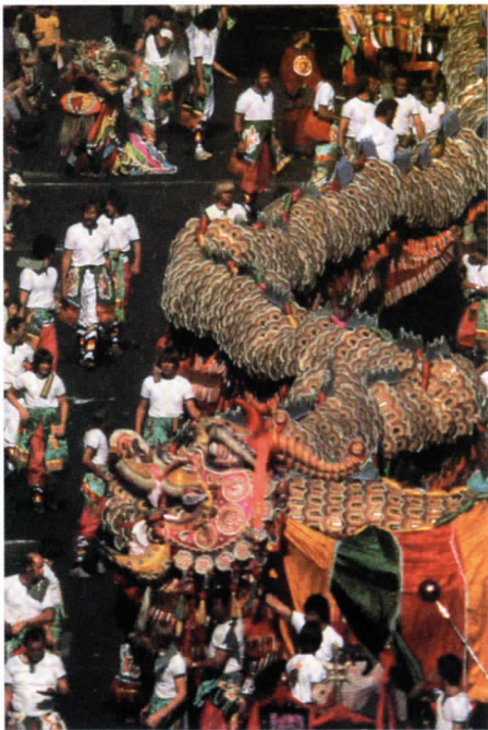
• Bendigo's world famous dragon Sun Loong

The Golden Dragon Museum in Bridge Street, houses a wealth of artefacts and historical data as well, of course, as the world famous dragons.