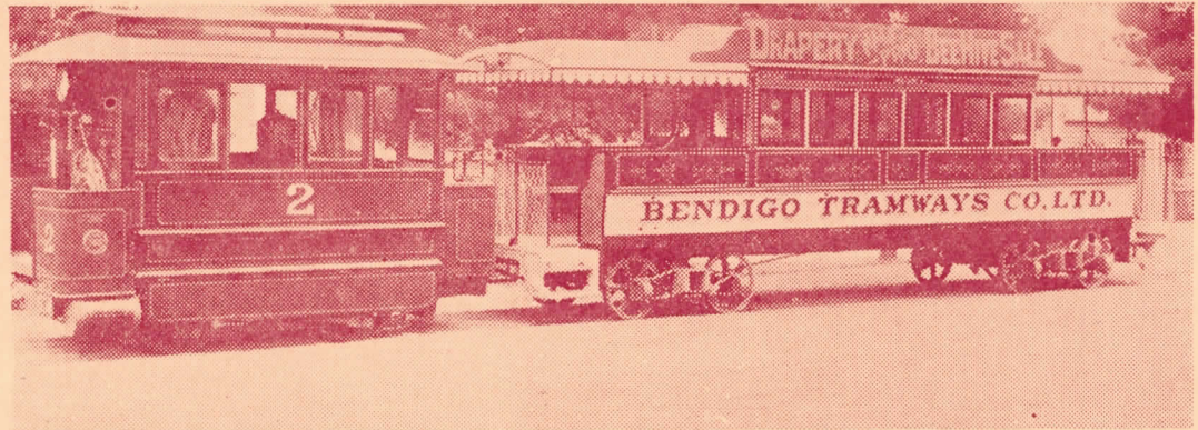
BENDIGO STEAM TRAMS, 1902.