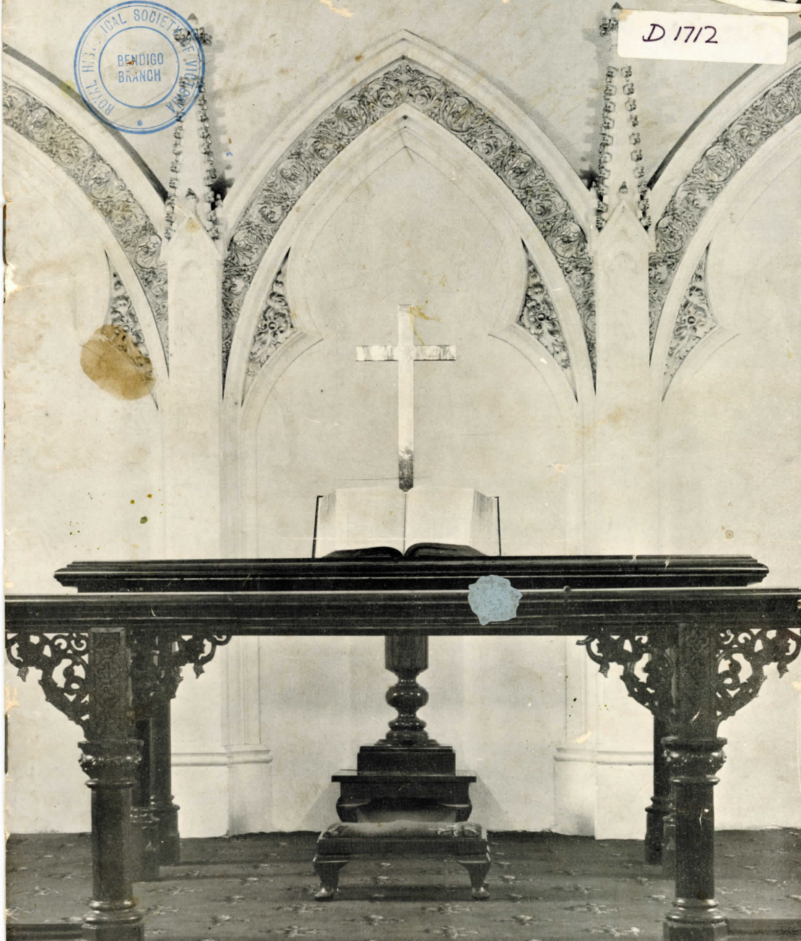
Forward Forest Street