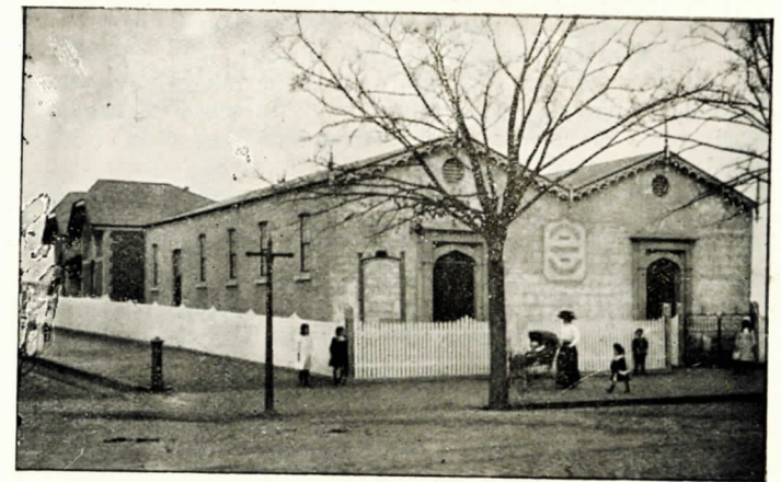
OUR SUNDAY SCHOOL.