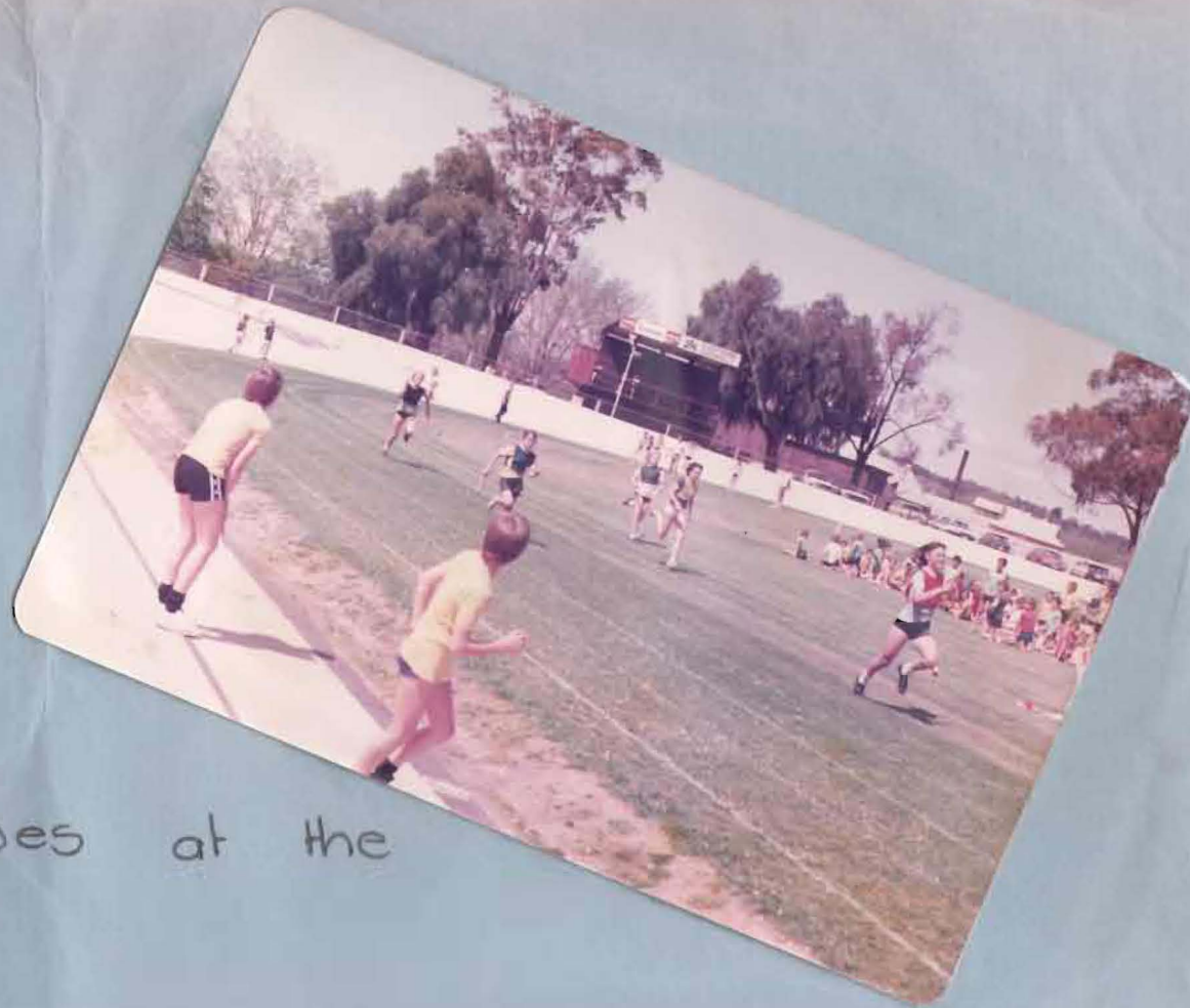
Our athletic heroes at the sports.