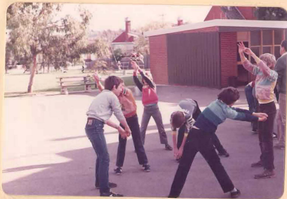
The boys in grade six pretending to be windmills.