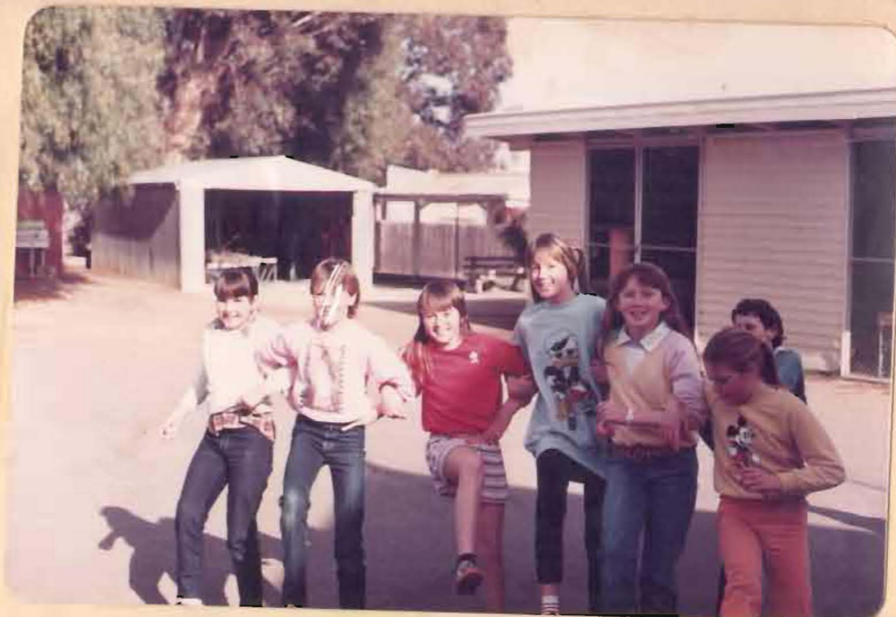
falling over or doing aerobics. The grade five girls doing the can-can!