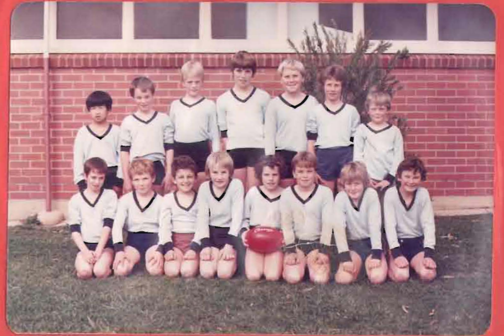
The "Modified Football Team" for 1984