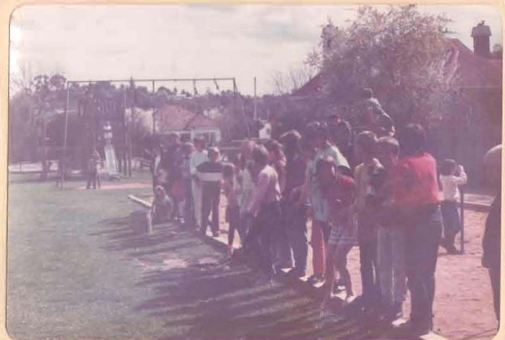
And the line went on and on