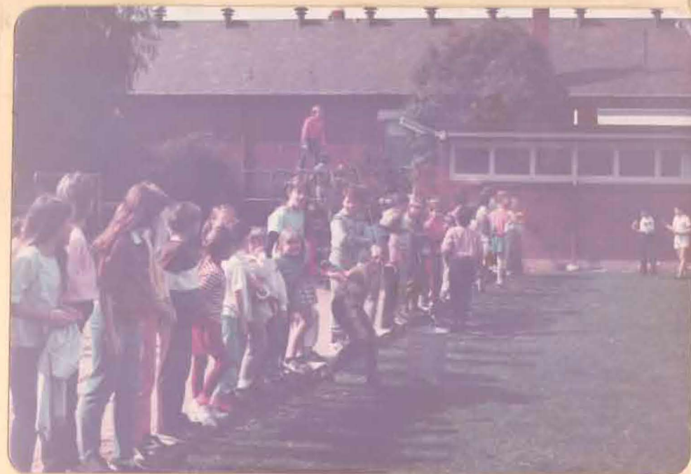
Lined up to try out the long jump.