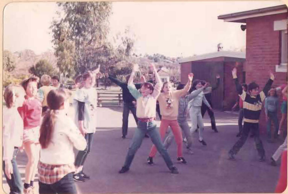
Every morning the grade fives and sixes did star jumps.