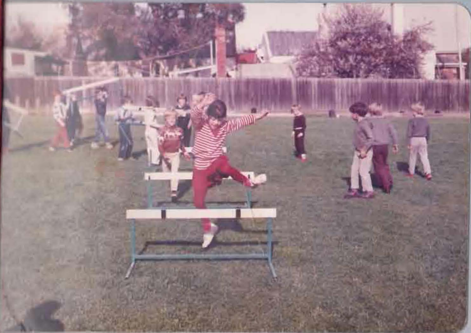
Even the grade one's jumped the hurdles.