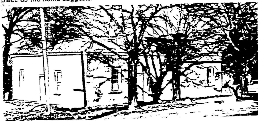
THE WINE HALL Previous Junction Hotel