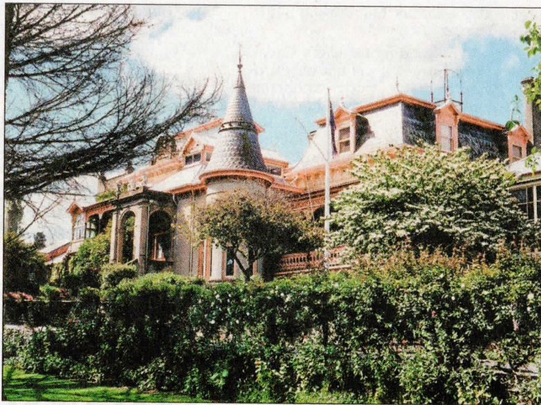
HISTORIC: Council candidates have been asked for their stance on Fortuna Villa.

It proposes that the City of Greater Bendigo take up the op-