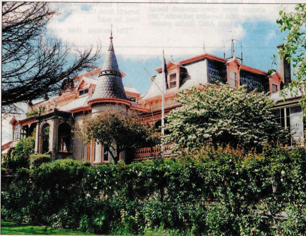
AN ICON: A Defence report asks potential developers to respect Fortuna's heritage.

gation, research and documentation of Fortuna; and