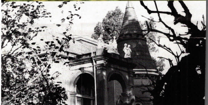
BELOW: The family architecture of the ornate Fortuna roof.