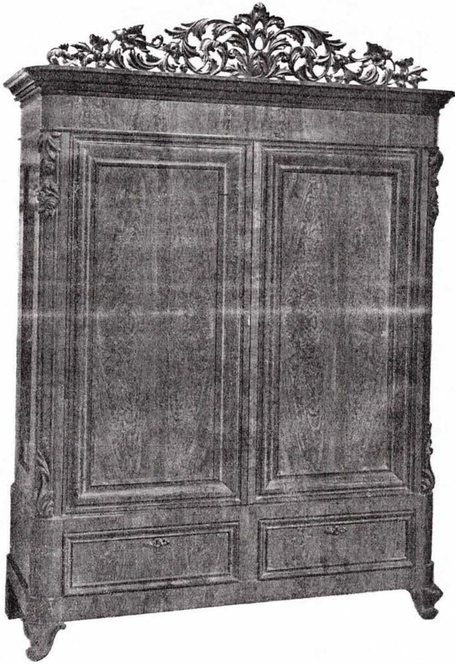
Lot 1334.—Very Fine Georgian Figured Mahogany Wardrobe.