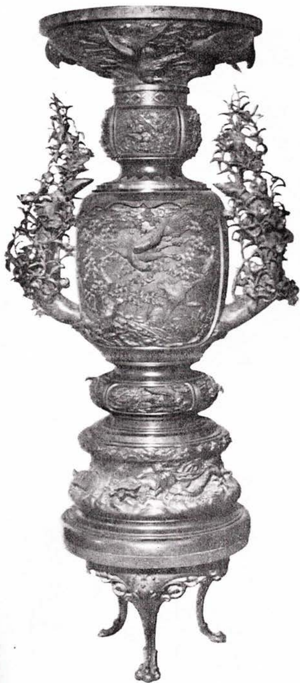
Lot 405.—Valuable Large Bronze Temple Incense Burner, standing 6ft. 6in. high (one of a pair)