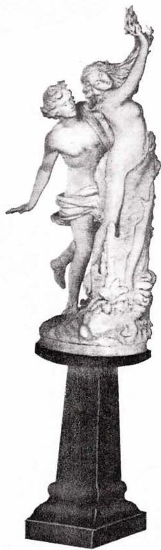
Lot 84.—Valuable Carrara Marble Statue, "Apollo and Daphne."