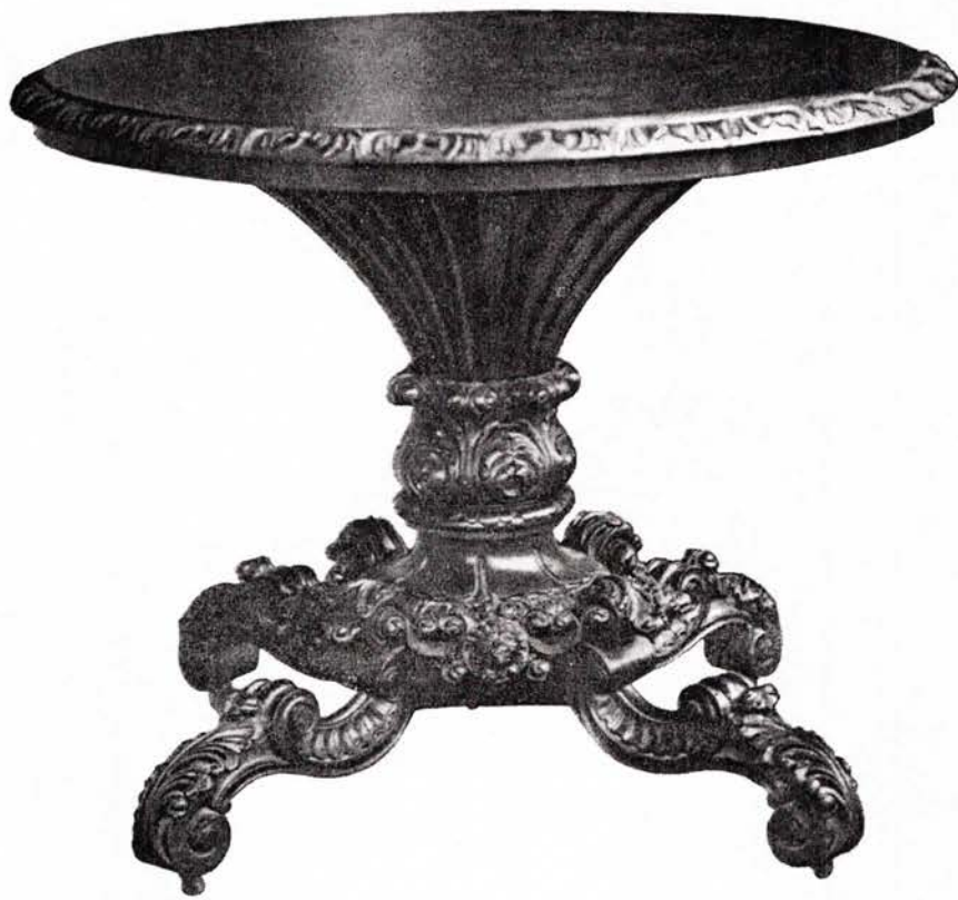
Lot 114—Gorgeous Exhibition Solid Rosewood Centre Table.