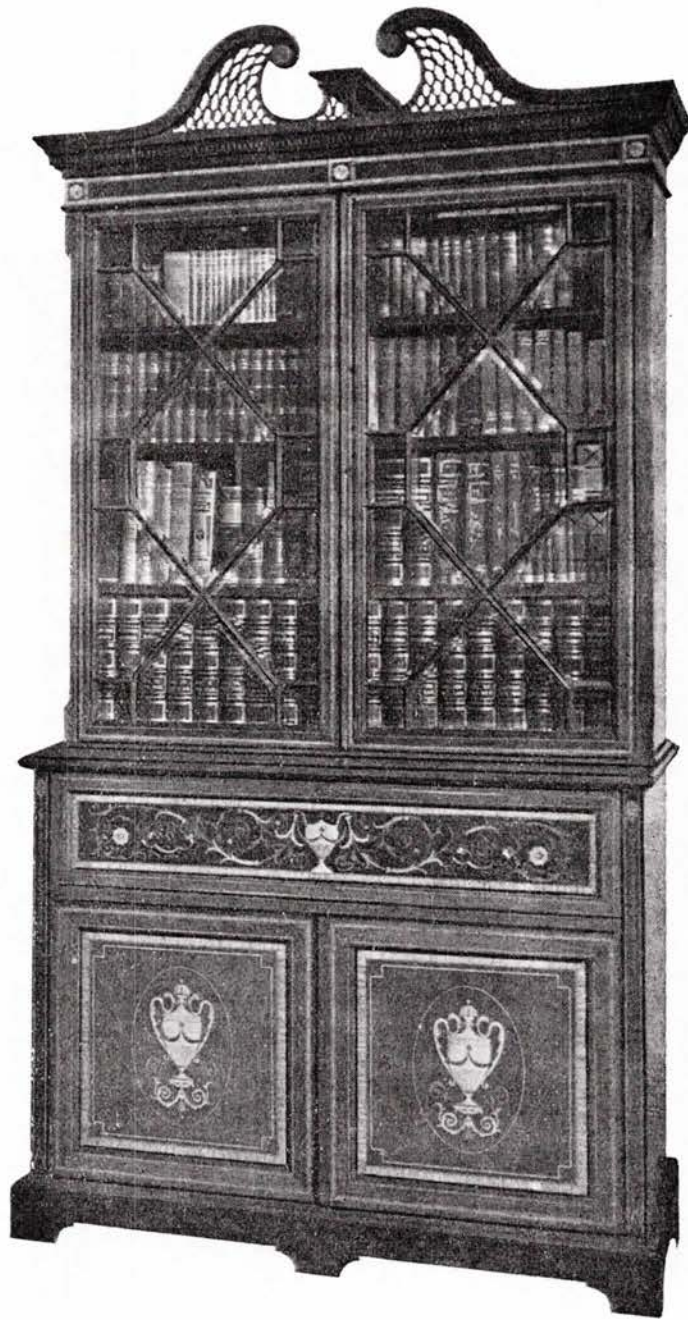
Lot 629.—Magnificent Inlaid Rosewood Sheraton Secretaire Bookcase.