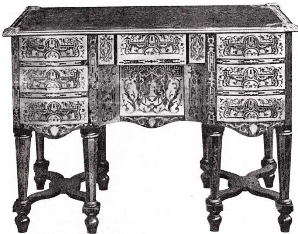
Lot 18.—Magnificent Louis Quatorze Lady's Writing Table.