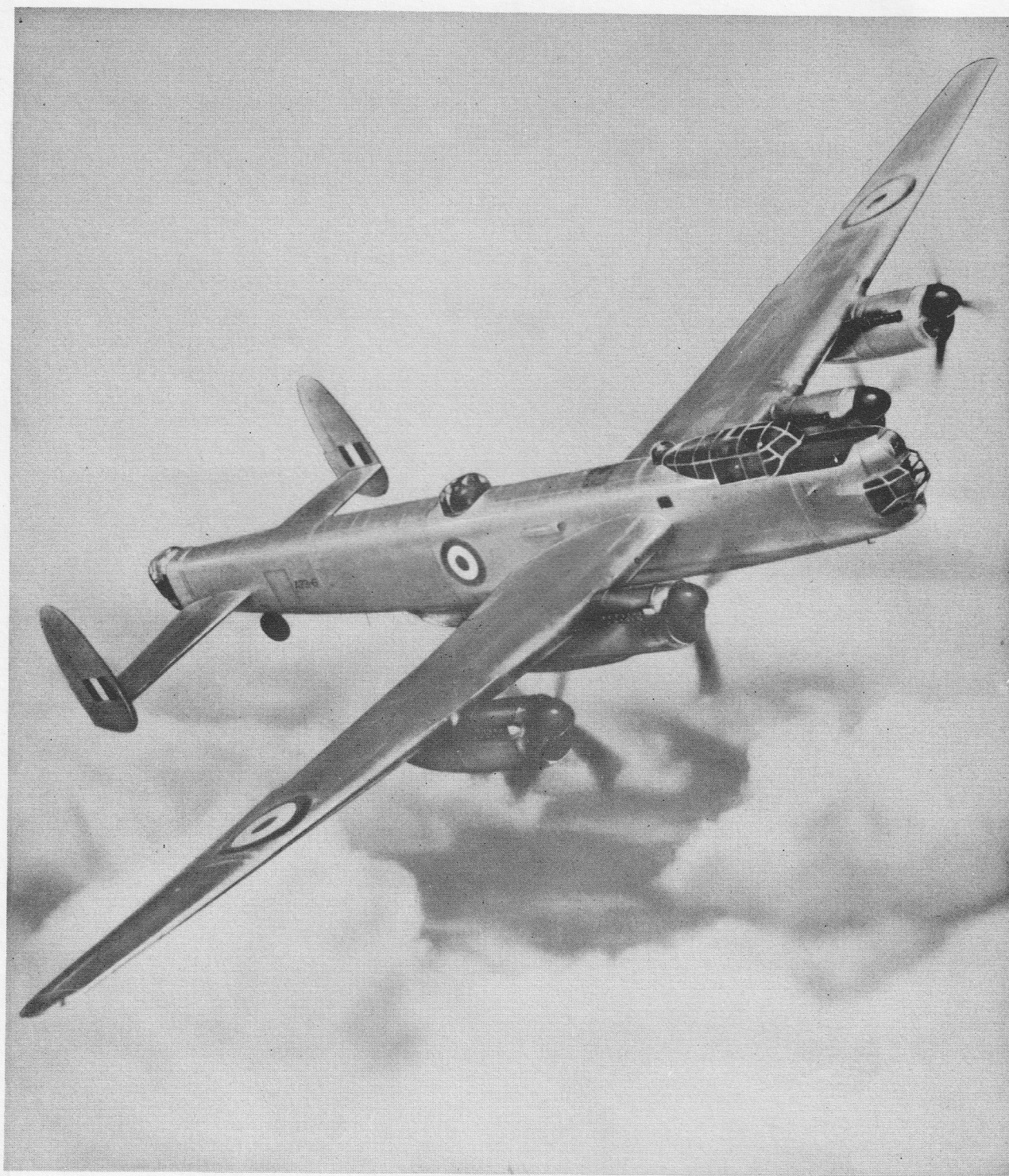
LINCOLN MK. 30