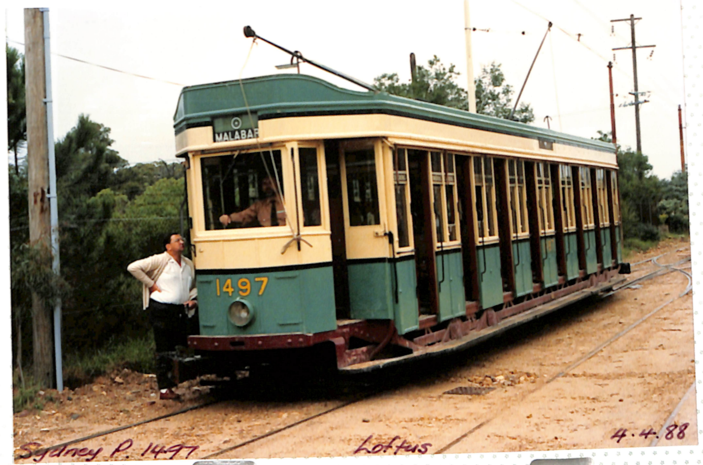
Sydney P. 1497