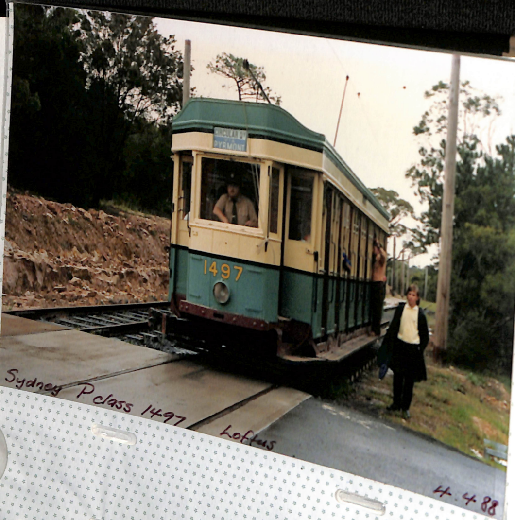
Sydney P class 1497