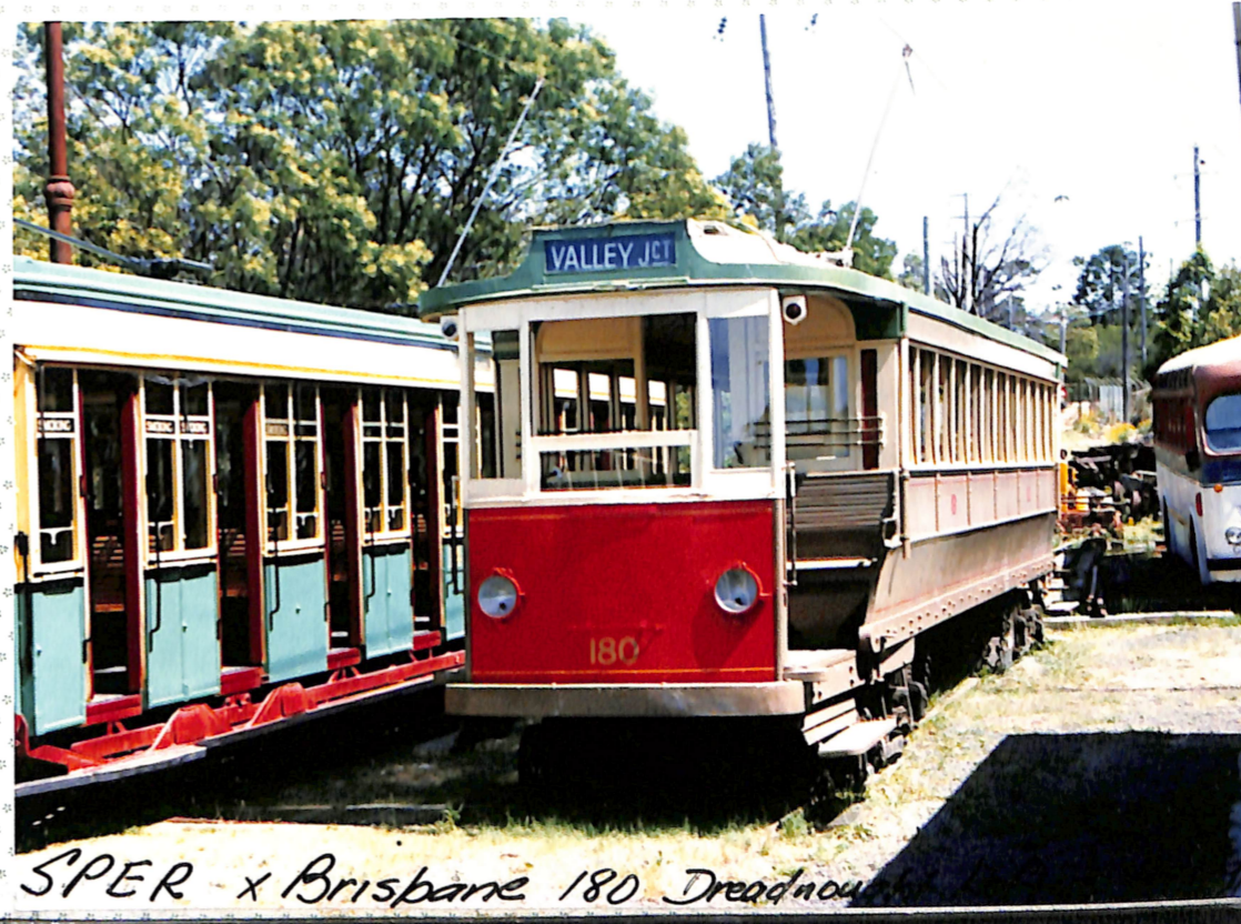
SPER x Brisbane 180 Dreadnought