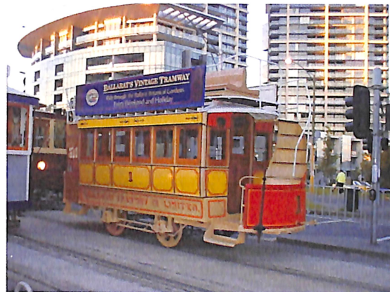
The Ballarat tram.

The trams were parked on Swanston St for the day's celebrations before heading back to the Preston Workshops at 3.00pm.