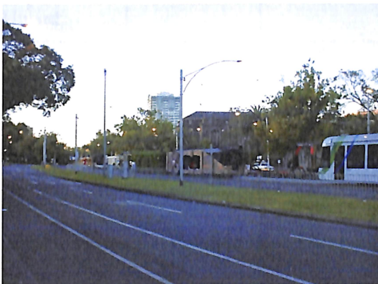
The trams at the St Kilda Rd assembly area early on Monday morning.

The drivers had to get their highly decorated, heritage and historic trams from the Preston Workshops to the assembly area on St Kilda Rd at Grant St before normal services started.