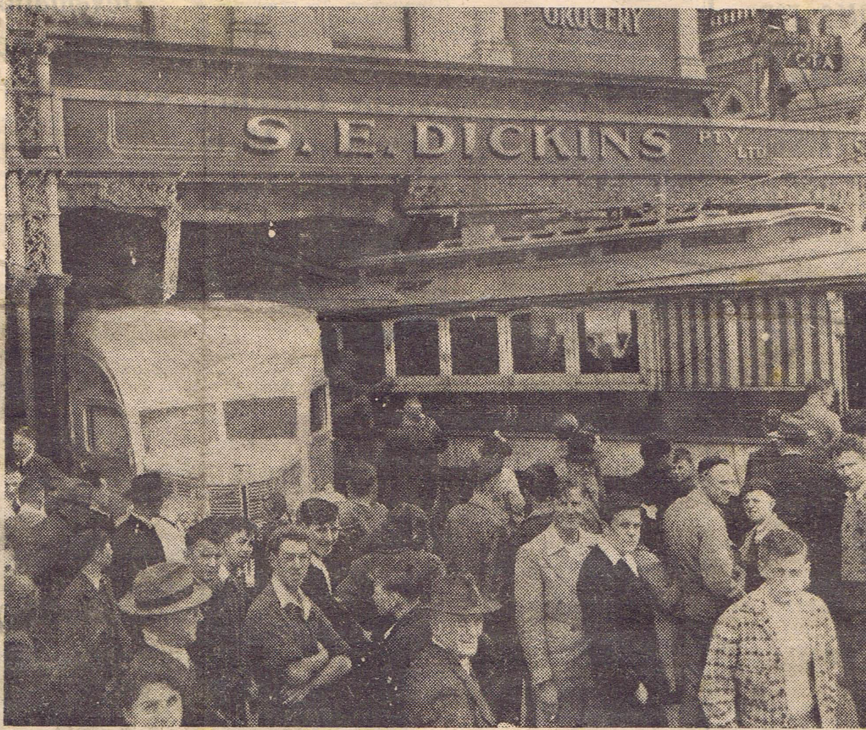
The resounding crash of a collision and breaking glass quickly brought hundreds of people to the Grenville, Bridge and Sturt street intersection on Saturday morning to inspect the damage done by the runaway tram.