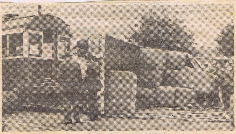
Another view of the scene of Thursday's tram-semi-trailer crash in Ballarat. (Story this page.) The closeness of the capsized semi-trailer to the tram is again shown, as is the work of removal of bales of hops from the transport.