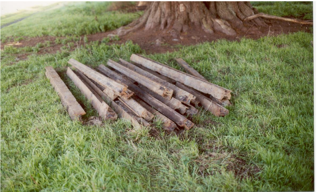
One of the piles of rails at Bungaree after removal from Skipton St.