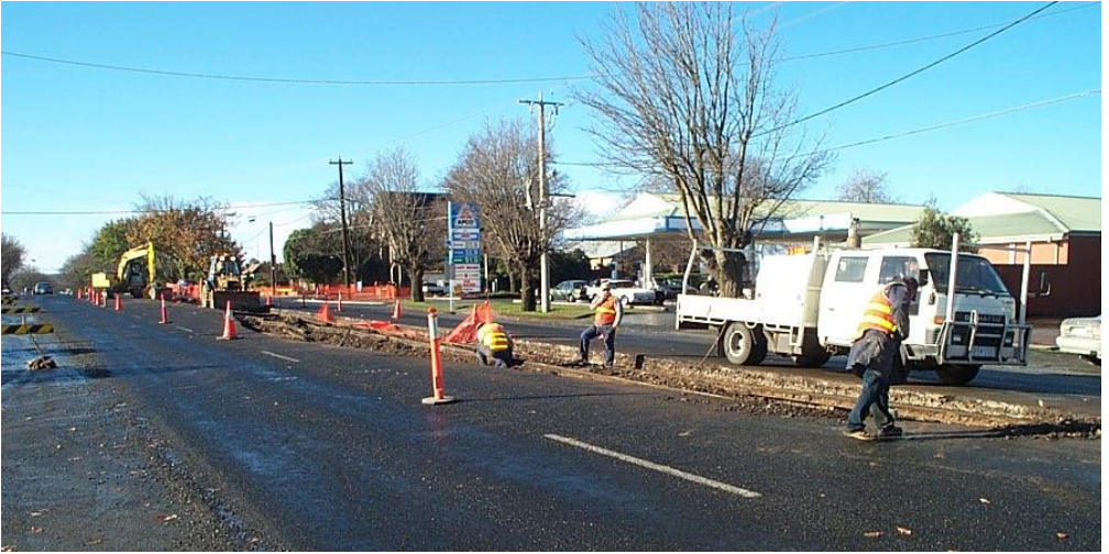
Old tram rail has been excavated for a Traffic Island and is being cut to length for removal - 14 June 2001.