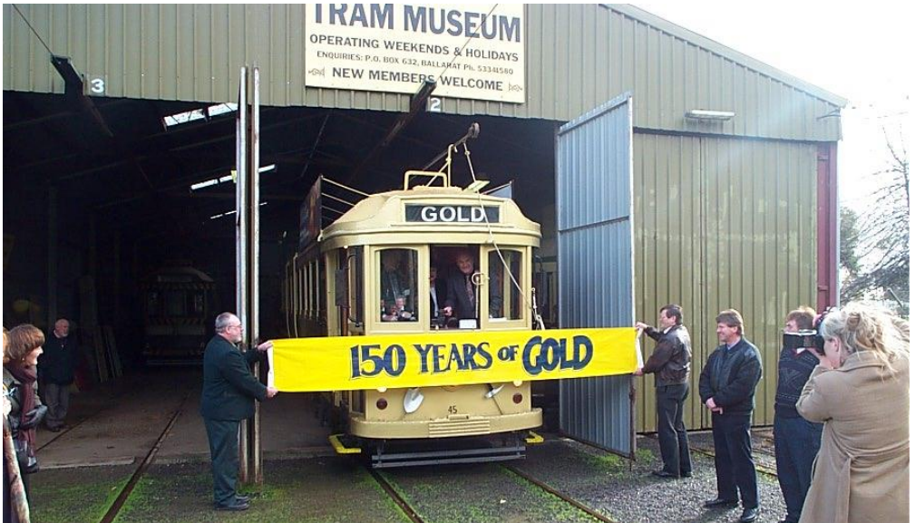
The Gold Tram is driven through the official launch banner.