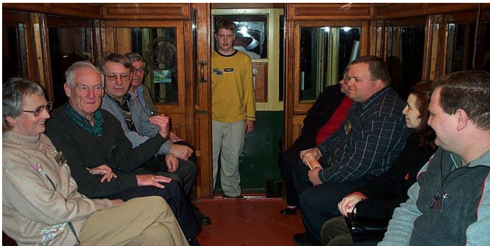
Photos of the BTM's 30 th Anniversary Dinner - 28 Sept. 2001